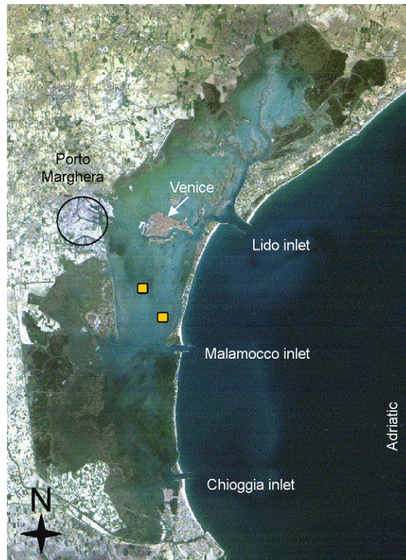
Fig. 3. Satellite view of the Venice lagoon with indication of the three inlets connecting the lagoon to the Adriatic sea. Porto Marghera is the industrial center with important petro-chemical facilities. Squares are where the SIOSED project is being developed.

Using a grab, the sediment was dredged 1 m deep and transplanted into the banks. The banks were contained by a wood-piling fence to protect against immediate erosion. The wood-piling area was also layered from the inside with fine mesh in order to retain and allow sedimentation of the smallest particles. The banks