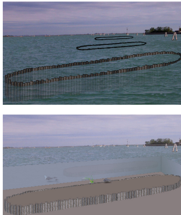
Fig. 4. Experimental sediment banks in the Venice lagoon during maturation process when the wood pilings were above water, and after maturation when the wood pilings were cut at the level of the compacted sediment.

Channels accumulate fine particles and organic material that can concentrate on various natural and anthropogenic contaminants. Such contaminants could leach from the sediment upon dredging, exposure to toxic condition, and translocation into shallows where water column hydrodynamics are greater. This research, therefore, quantifies such leaching, and determines whether it has a possible impact on the