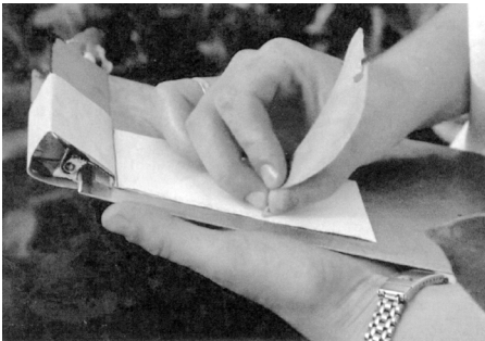
Fig. 3. The same team as in Fig. 2, is able to collect, print and analyze samples from about 1,250 plants per day.

sue print-ELISA were confirmed as infected by both techniques. Of the seven trees which were positive by PCR only four were positive by IC-PCR and negative by tissue print-ELISA, and the remaining three