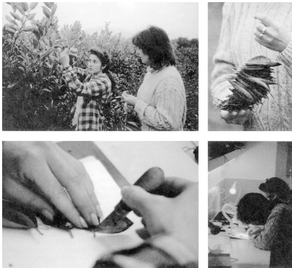
Fig. 1. A two person-team collecting samples in open field. Leaves from a plant are held on a wire and each set is separated from another by a piece of plastic. Petioles are cut and membranes imprinted with them in the laboratory of Viveros Valencia (Peñíscola, Spain) citrus nursery.

terial remains succulent over the growth of the plants in the nursery, and can be easily collected without damaging the plants. In addition, prints from leaf petioles occupy less space on a membrane than sections of the stems, allowing a higher number of tests per membrane. Table 1 summarizes the evaluation of the routine analysis of nursery plants performed by a two-worker team by different techniques.