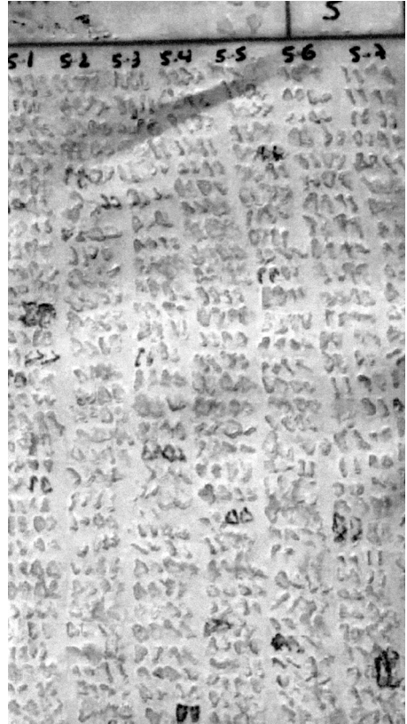
Fig. 4. Overview of a 7 × 13 cm membrane printed with stem sections. The stained vascular area of stem sections indicate that the plants are infected with CTV.

were CTV negative by both techniques. The four trees CTV positive only by PCR were sampled again and analyzed by nested-PCR in a single closed tube and indexed on Mexican lime indicator plant, and all were found negative by both methods.