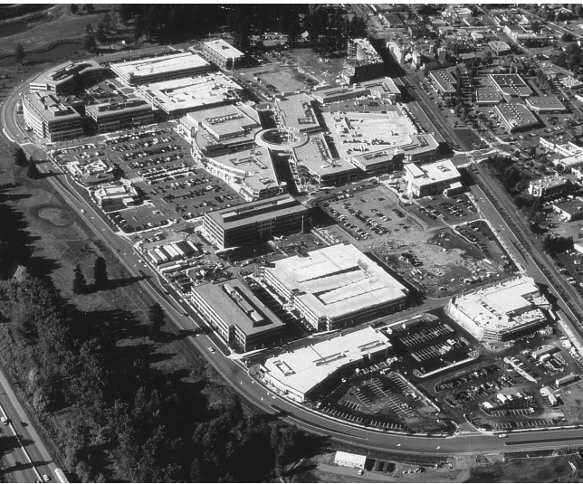
Redmond Town Center