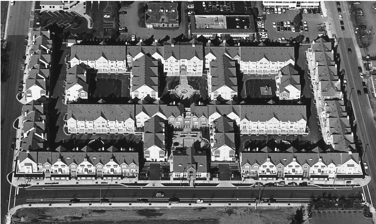
Lion's Gate housing Above: Aerial view

between making a secure inside and being connected to the town that is the project's genius and its dilemma.