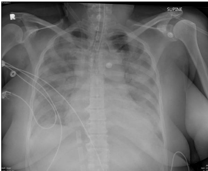
Figure 1: Chest X-ray on day of admission showing extensive diffuse airspace opacification with left retrocardiac opacification consistent with pulmonary edema, pulmonary hemorrhage, pneumonia, or ARDS.