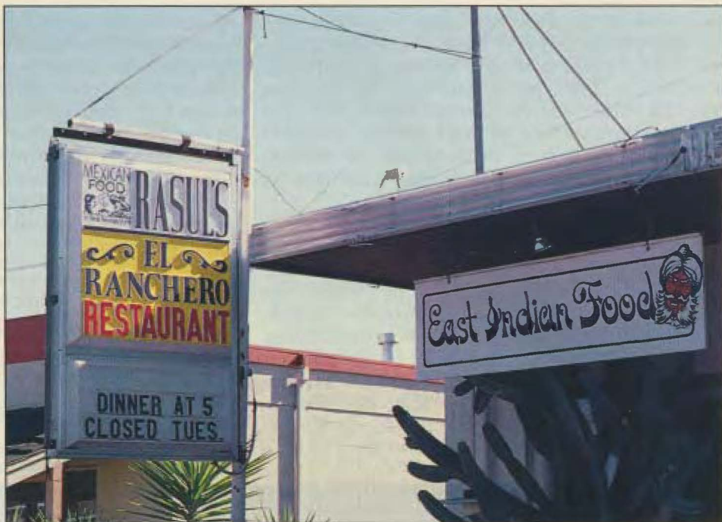
JOHN RAINIER/THE WORLD & I

The women came from a similar material culture, it seems, but what about the religious differences? The men and their descendants state repeatedly that all religions are the same, a view again in sharp contrast to that expressed by more recent immigrants from India. The statements take different forms: The Sikh religion is just like the Catholic one; Sikhism is a composite of Islam, Hinduism, and Christianity; the Granth Sahib is just like the Bible; all gods are the same, but they are called different names because languages are different; Sikhism has the ten cruz, or ten crosses which are the ten gurus; the founding Sikh guru preached just what is in the Old Testament; Sikhs have all the commandments Catholics have; one can be Muslim and Catholic or Sikh and Catholic at the same time.