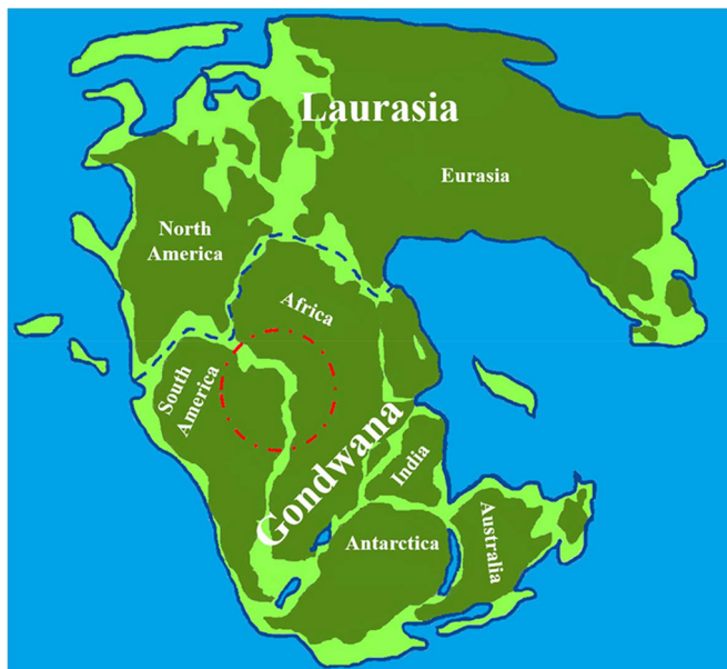
FIG 1 Representation of the supercontinent of Pangea with outlines of the present continents. The red circle denotes the proposed biogeography of the Pangean ancestor of both the C. gattii and C. neoformans species complexes. Also shown are the two supercontinents that came together to form Pangea, Laurasia and Gondwana (separated by a dashed blue line). This map was designed by tracing an outline of the supercontinent of Pangea via a Google Image search. The organization of subcontinents (Laurasia and Gondwana) is based on reference 47.

created conditions for spatial isolation. Hence, the wide difference between estimates of the separation time of the C. gattii and C. neoformans species complexes, which include significantly more recent dates than the separation of Africa and South America, could still be reconciled with a precipitating event associated with the breakup of Pangea. Furthermore, we note that the suggested speciation event is very different from the current situation, where lineages of both complexes occur simultaneously in diverse geographic regions throughout the globe. We propose that continental drift was the initial trigger of speciation and that the current geographic distribution of the two cryptococcal species complexes is the result of subsequent introduction and dispersal events, including anthropomorphic causes, such as the global dispersal of Columba livia (rock dove or pigeon) from its Mediterranean origin in recent centuries (16).