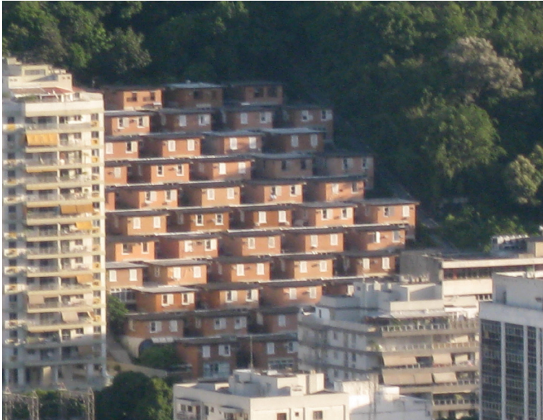
“An orderly favela,” formal development across from the favela Santa Marta, Rio de Janeiro

Solely focusing on physical transformations and viewing informal settlements as purely built form can lead to an aesthetization of the area, turning informal settlements into simple representations drawn up by the “bourgeois gaze.” 13 How can architects address the favela without dismissing it as a “slum” and without romanticizing poverty and transforming it into a theme park?