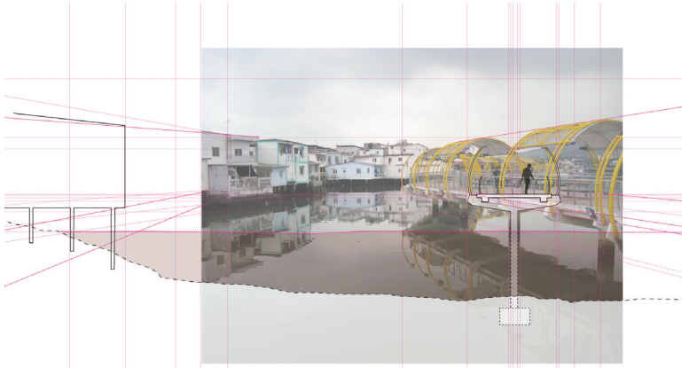
Malecón del Salado Boardwalk and Waterfront Renovation , Guayaquil