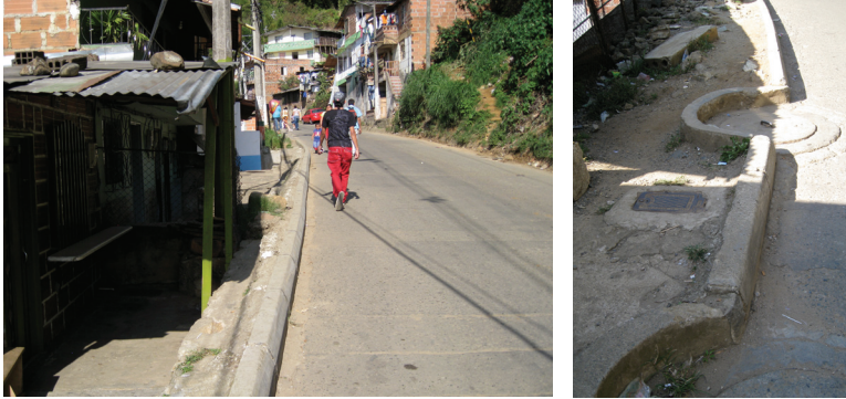
Pedestrian circulation in Santo Domingo

dangerous situations where pedestrians, cars, trucks, and playing children are all sharing the same narrow space.