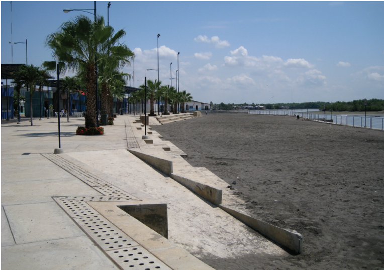
La Playita, Guayaquil

Also, in Caracas, architects and universities are studying and proposing design-based interventions for the city's barrios. One of the largest and more publicized projects is the recently finished cable car system in the barrio San Agustín.