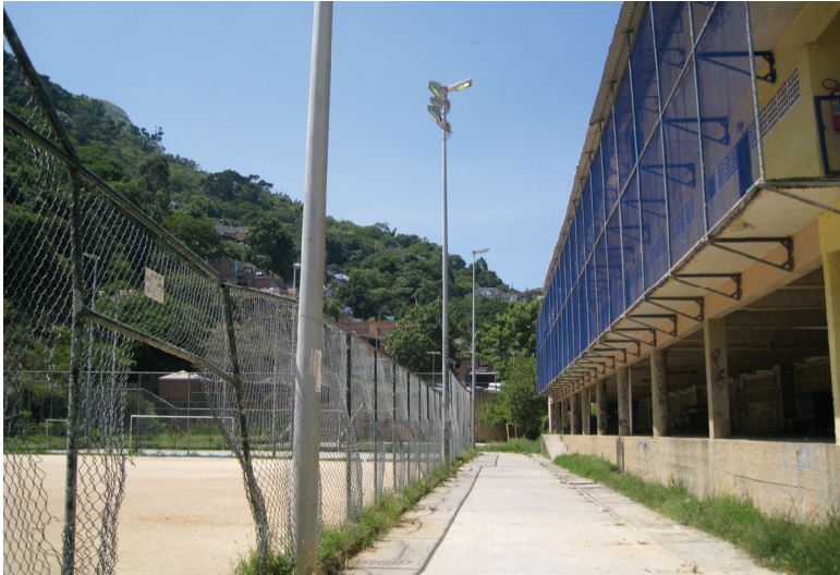
Sports field, favela Vidigal, Rio de Janeiro

Maintenance: The maintenance of projects may be difficult given high funding requirements. Therefore selection of materials and operational costs need to be considered in the conception and design phases of a project. Also, design and construction should further acknowledge and prepare for certain realities of the settlement, such as acts of vandalism and “recycling” (of materials, fixtures and furniture). Strictly from a design and planning perspective, projects should aim for self-sustainment. Some cost-reduction strategies stemming from the case studies include programs of mixed-use and commercial spaces as money generators and employment opportunities.