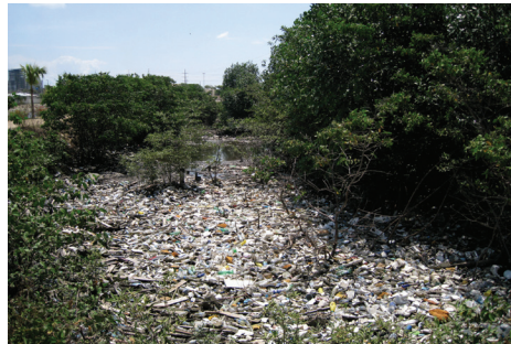
Waste management is a recurring problem