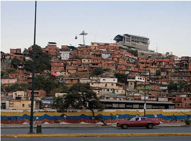
Metro Cable in San Agustín, Caracas (Venezuela).

Form: The term is used to discuss physical and morphological characteristics of a structure or physical intervention.