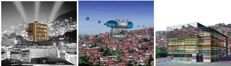
Projects by Urban-Think Tank

Since the 1950s, cities in developing countries have faced unprecedented increases in urbanization and poverty rates, resulting in an uncontrolled proliferation of informal settlements. 2 Some Latin American countries quickly became laboratories for large-scale urban experimentation, particularly regarding ‘slum upgrading.’ Initially consisting of mostly clearance and redevelopment projects, self-help sites and services, and public housing programs, ‘slum upgrading’ in the region has evolved to encompass strategies usually characterized as urban acupuncture, aiming to minimize displacement while at the same time attempting to improve conditions in the area. We are now witnessing spectacular libraries in depressed neighborhoods, cable car systems in marginalized areas, and