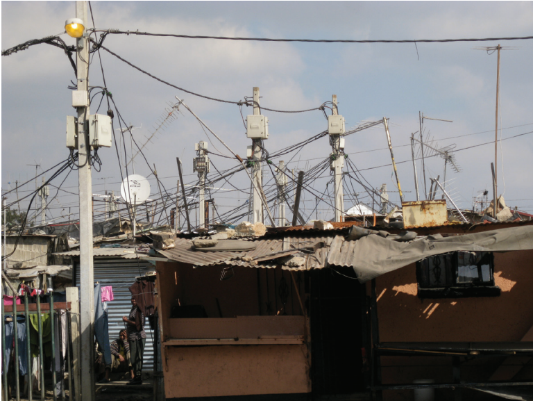
Electric Posts, Township of Alexandra, Johannesburg (South Africa)