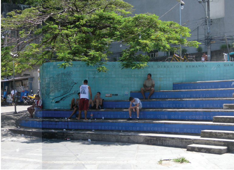
Vidigal Favela, Rio de Janeiro (Brazil)

Rio de Janeiro's Favela-Bairro is one of the largest neighborhood-upgrading programs in the world. Seeking to turn depressed areas into functioning neighborhoods, the program emphasizes the provision of services and the construction of community centers, daycare facilities, communal kitchens, new streets, and pedestrian walkways in medium-sized favelas.