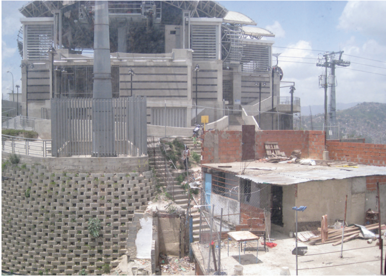
The bases of the San Agustín Metro Cable (Caracas) were originally designed to be open, accommodating various programs for the community. The photograph above shows that they were walled-off due to lack of funding.