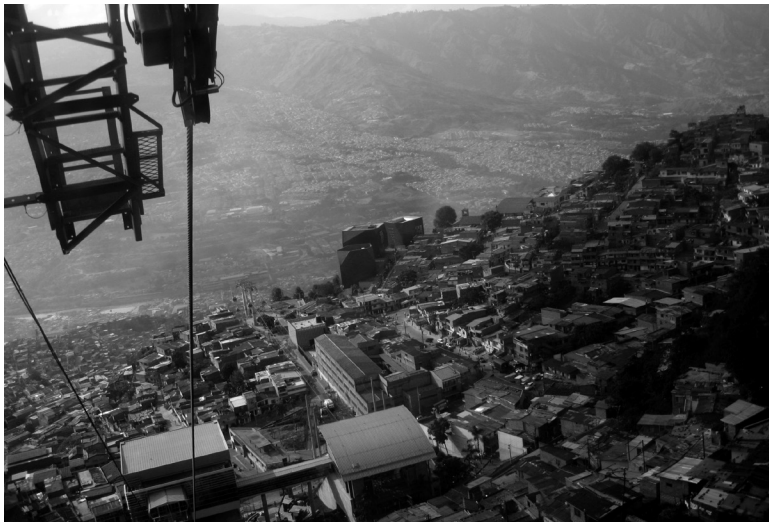
Metro Cable Santo Domingo, Medellín ( Colombia)

Based on comparative field studies in South America, this essay will illustrate the potentials and limitations of current practices in 'slum upgrading.'