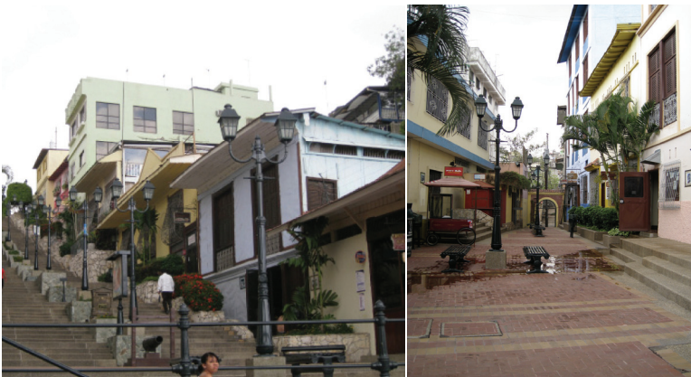
Las Peñas, Guayaquil