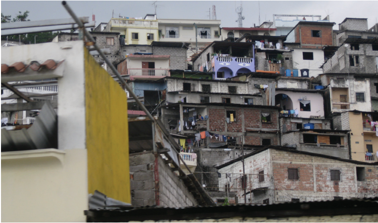
Informal Settlement, Cerro Santa Ana Guayaquil (Ecuador)

In developing countries, the most noticeable of these spaces consist of informal settlements or favelas. In simple terms, favelas are unplanned, underserved areas, lying outside of the conventions and rules of the planned and legal city. Although favelas remain morphologically distinct from the rest of the city, they are not separate or dichotomous from the formal city, or asfalto , but are in persistent flux and change, constantly redefining their relationship with the formal. In many cases, favelas are located in sites that are difficult to manage (e.g. flood plains, ravines, steep slopes), and sometimes within toxic sites like sewage canals, industrial facilities, and landfills. These sites are also generally separate from formal urban infrastructure and lack access to basic services and formal transportation systems. 6 In cases where services have been self-provided (or “pirated”), conditions can be dangerous and unhygienic. High densities, lack of public space and equipment, and the high danger of being located in polluted sites or landslide risk areas results in environmental, public health, and security problems for its inhabitants. Likewise, the internal hierarchies in favelas (including gangs and drug trafficking) raise strong public safety questions and accentuate marginalization and stigmatization.