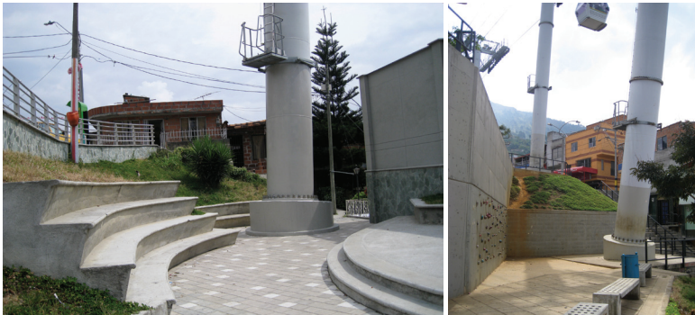
Above: Large, open public space (sports field) Below: Small, semi-public spaces at the base of the Metro Cable

Mobility: In addition to larger infrastructure projects, there is a need for better pedestrian circulation networks in the area. For example, the lack of sidewalks and other connecting alleys or stairs obligate pedestrians to circulate in main streets. One frequently encounters