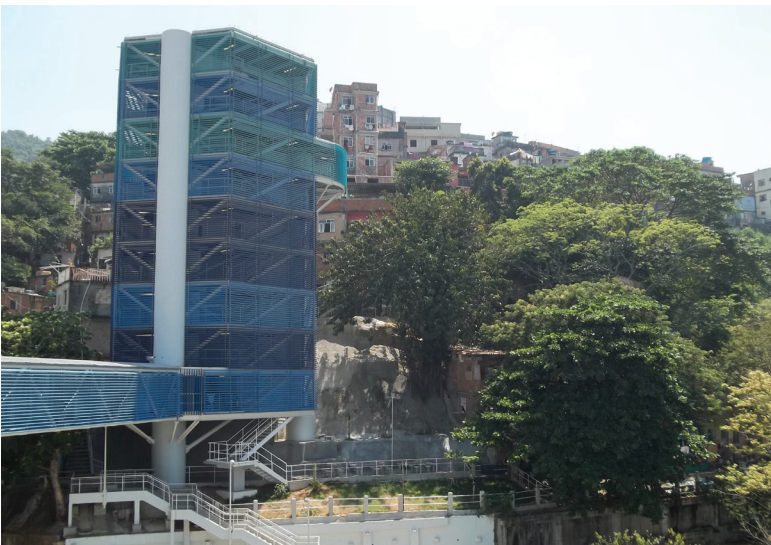
Elevator, Pavao, Pavaocinho, Rio de Janeiro