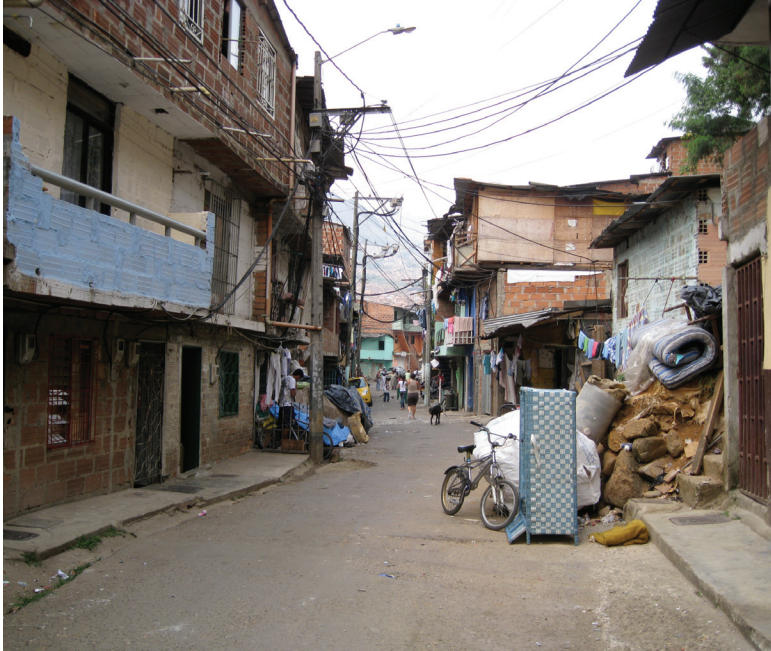
Moravia, Medellín (Colombia)

way of providing housing, and seek to minimize displacement and integrate the favela with the city. In this respect, projects focus on aspects that are most absent in settlements: infrastructure, public space, and public equipment. Based on comparative field studies in South America, analyzing specific case studies, the first part of this essay provides a redefinition of assumptions, while discussing the potentials and dilemmas in the adoption of a Favela Chic paradigm.