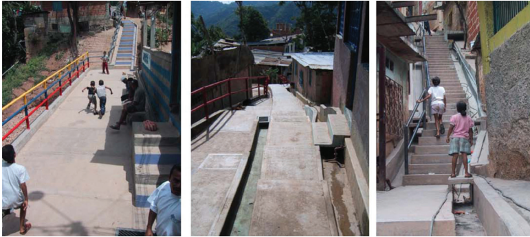
La Vega, Caracas (Venezuela)