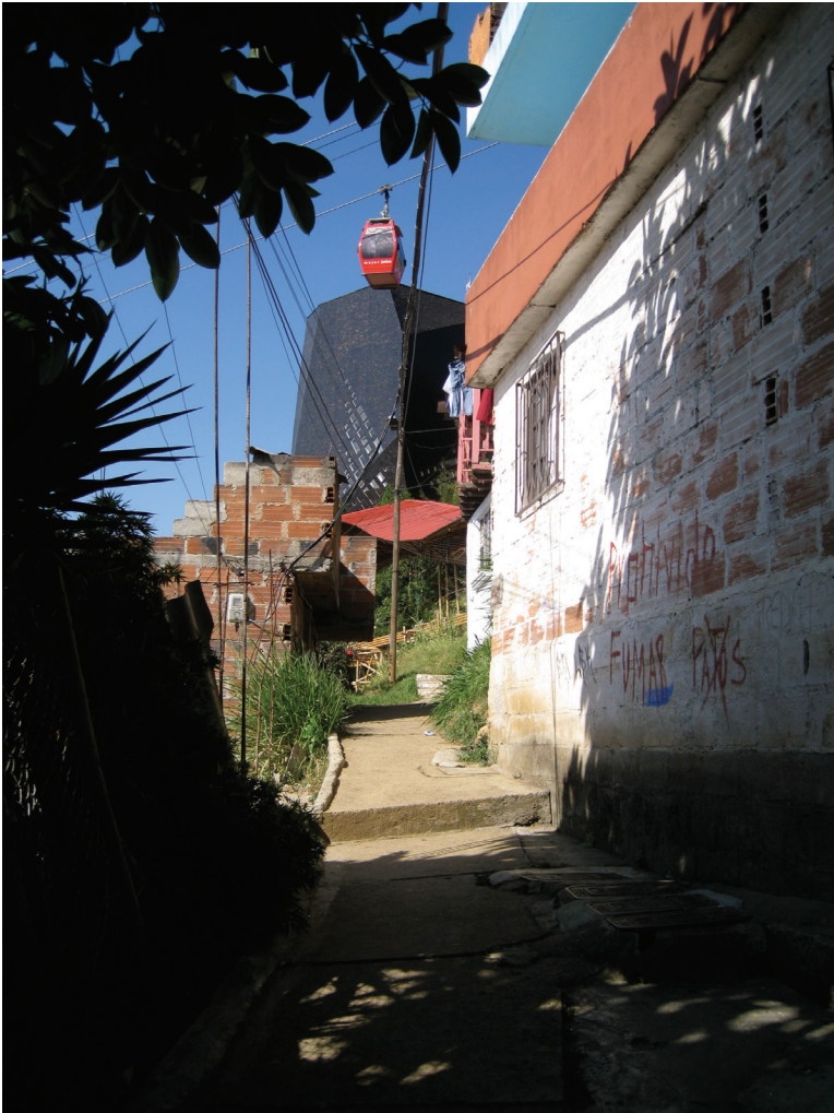
Metro Cable and Library Park Spain, Medellin

For example, Medellin, Colombia's second largest city, has executed several initiatives under the term of Social Urbanism. Following former mayor Fajardo's slogan: "Medellin la más Educada," 11 new interventions were designed to upgrade the city's most depressed areas. Some of the most recognized projects are part of the Proyectos Urbanos Integrales (PUI), or Integral Urban Projects, such as the aerial cable car system Metro Cable , and the city's Library Parks ( Parque Bibliotecas ) and Quality Schools ( Colegios de Calidad ).