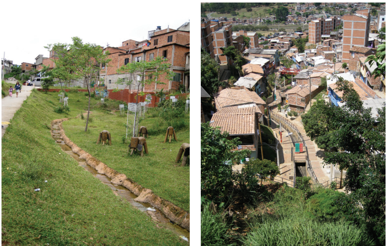
Left: Iporanga (Guarapiranga Reservoir), Sao Paulo Right: Juan Bobo Creek, Santo Domingo, Medellín