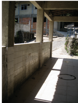
What is left of a communal laundry facility, favela Vidigal, Rio de Janeiro