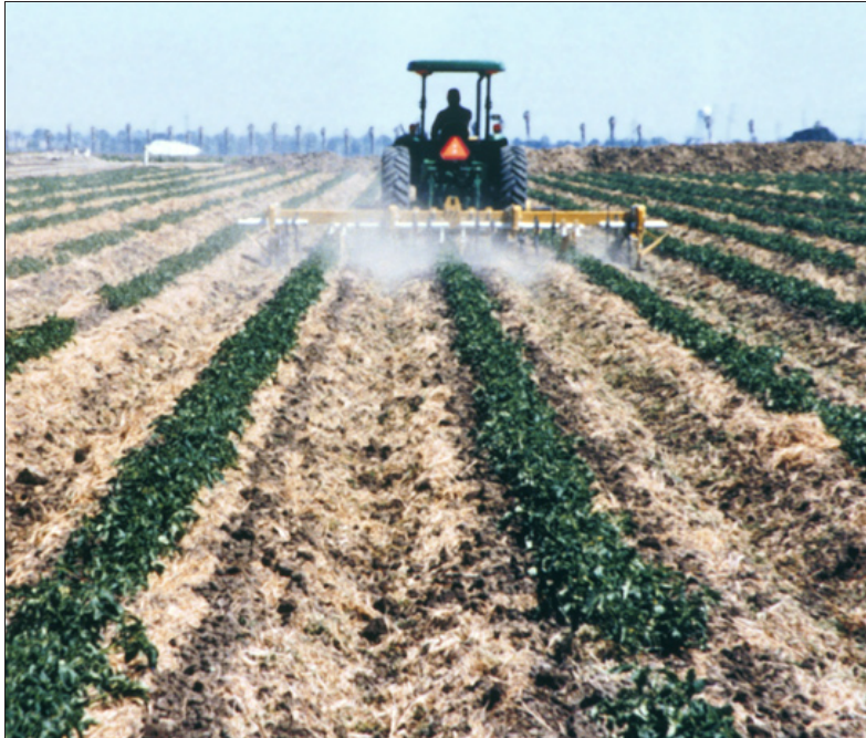
Figure 3. High-residue cultivation of strip-till transplanted processing tomatoes, Tracy, California, 1999.