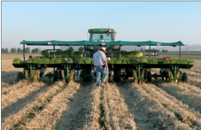
Figure 9. Transplanting fresh-market tomatoes in conservation tillage field, Sun Pacific Farms, Firebaugh, California, 2003.