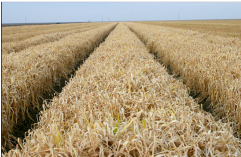
Figure 10. Triticale cover crop planted on bed tops in conservation tillage field, Sano Farms, Firebaugh, California, 2005.