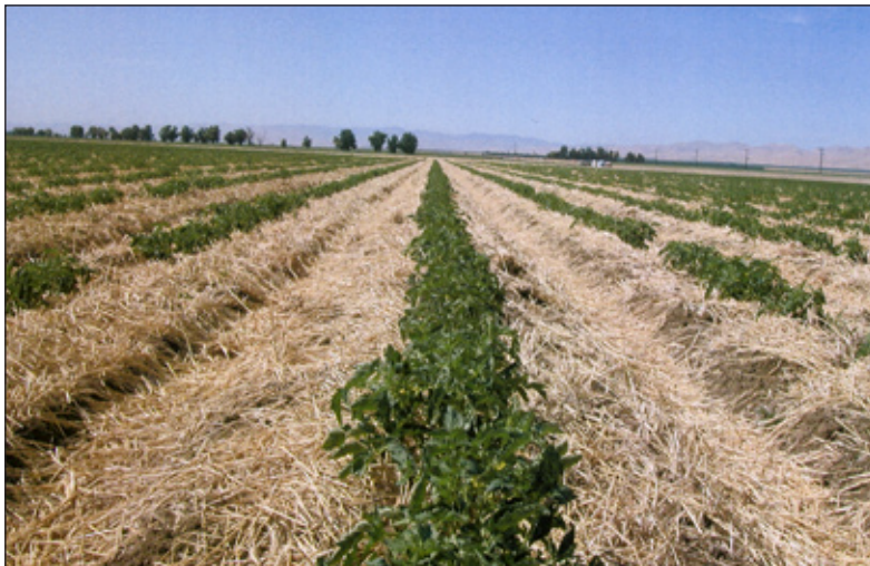
Figure 13. Strip-tilled transplanted fresh market tomatoes in barley cover crops, Sun Pacific Farms, Firebaugh, California, 2003.