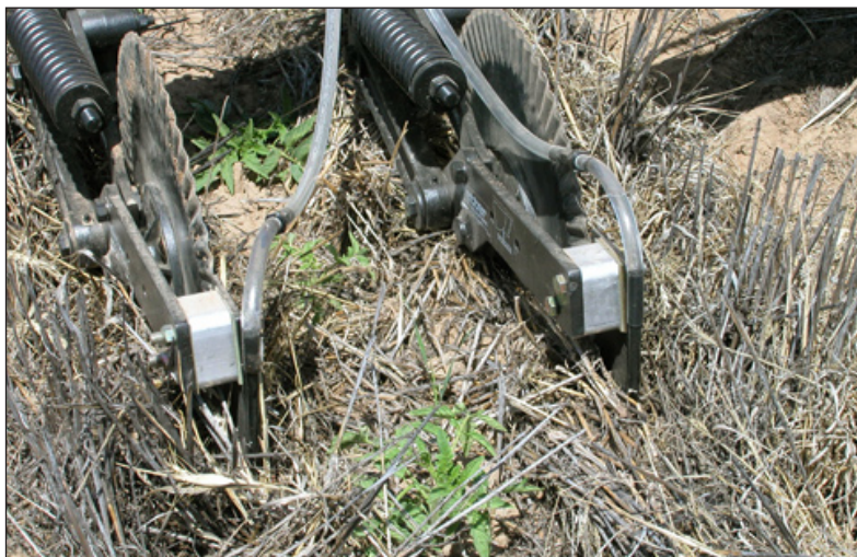
Figure 5. Applying liquid fertilizer as a side-dress to fresh market tomatoes in Parlier, California, conservation tillage study, 2002.