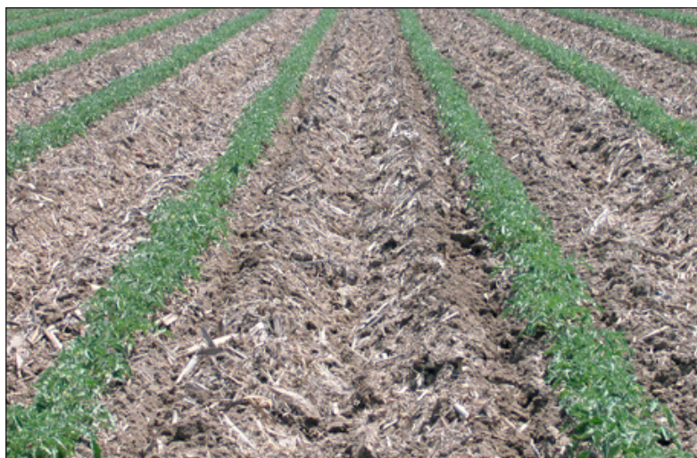
Figure 7. Cultivated processing tomatoes in Davis, California, conservation tillage study, 2004.

cleaning mechanism before the product entered tomato transport trailers.