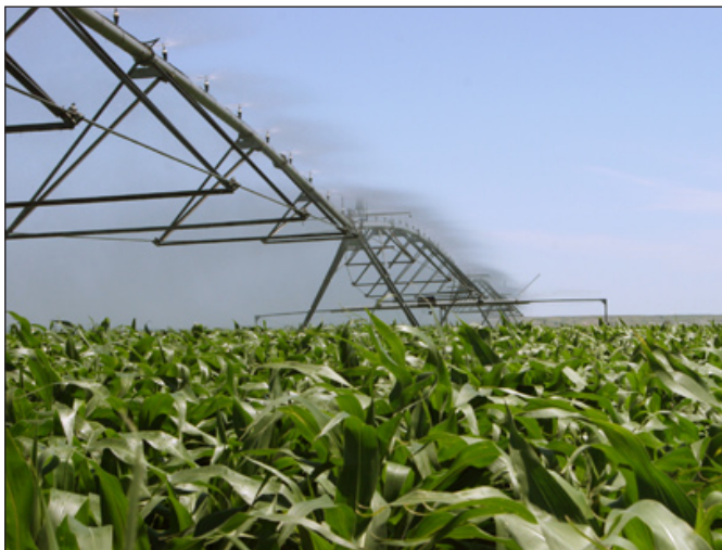
Figure 14. Overhead low-pressure irrigation system used for no-till corn production field, Pierre, South Dakota, 2005.