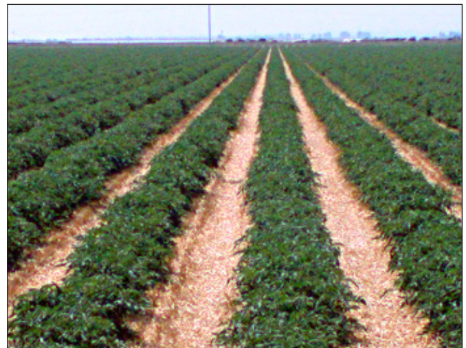
Figure 15. Fresh-market tomato field with barley cover crop residue, Firebaugh, California, 2003.

An additional modification of today's standard production systems that may further facilitate CT alternatives would be the use of controlled traffic harvest trailers that track only in permanent furrows and not on bed tops. By restricting heavy loads to the furrows, optimal crop growth zones might be preserved across the beds due to less compaction. Also, ideal cover crops should be developed for CT systems that are inexpensive, fast to establish so that weeds are suppressed, and easily destroyed mechanically or with herbicides as needed before transplanting.