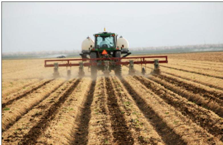
Figure 11. Strip-tilling centers of processing tomato beds in conservation tillage field, Sano Farms, Firebaugh, California, 2008.

However, in the 2003 trial, CT yielded 12 tons per acre more than ST. Using a crop value of $54.40 per ton, the gross return was higher by $756 per acre with CT. Custom harvest is charged on a per ton basis; therefore, the higher yield in 2003 for CT resulted in an additional harvest cost of $126 per acre. The increase in revenue per acre offset by the increase in harvest cost meant an increase in net returns over harvest cost of $630 per acre. Adding the savings in cultural costs and overhead costs ($106) to the increase in revenue adjusted for the increase in harvest cost ($630) gives a bottom line of an increase in profit of $736 per acre for CT.