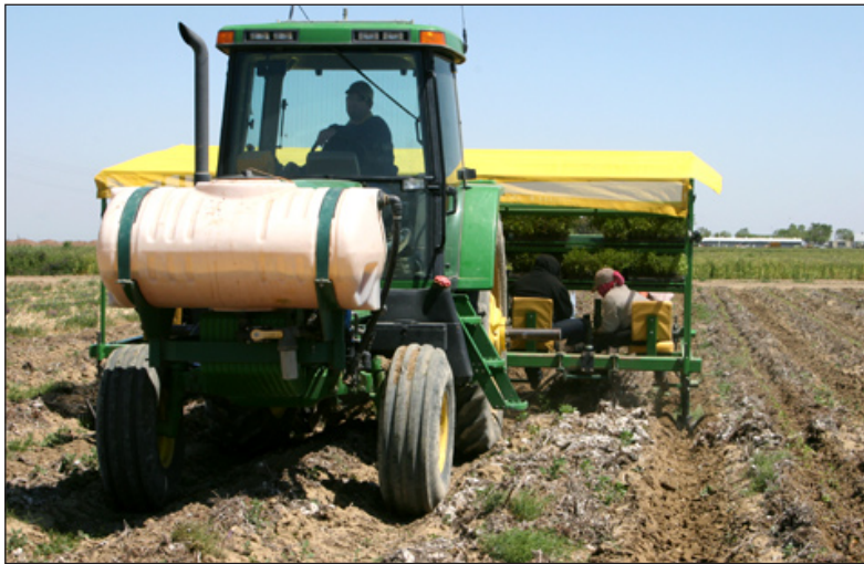
Figure 6. Transplanting tomatoes into “unworked” cotton beds from previous season in Five Points, California, conservation tillage study, 2005.

Note: Letters following each yield number indicate whether there were statistically significant differences between treatments within a given year; different letters in a particular column indicates that the systems likely had significant differences in yield.