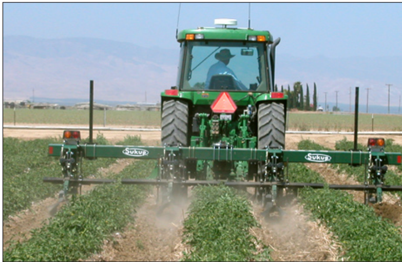
Figure 4. Cultivating no-till transplanted processing tomatoes in Five Points, California, conservation tillage (high residue) study, 2004.

Processing tomato yields (cv. Heinz 8892) for 2000 to 2004 are shown in table 3 . CT-NO yields matched or exceeded those of ST in all 4 years while using considerably less tillage. Yields of CT-CC were lower than the other systems in 2000 and were lower than the CT-NO in each of the next 2 years of the project as well. We observed that tomato plants often grow more slowly early in the season over the heavy CT cover crop mulches; this is perhaps due to the lower temperatures we measured above and below the mulch. As this project has now continued through an additional 4 years, yields of the CT-CC system continue to fluctuate more than those of the other three systems. In some years, plant growth catches up with that of the other systems, but in other years it does not. We speculate that a combination of factors may account for these problems in the CT-CC system, including lower soil and aboveground temperatures, more weed competition, and perhaps nitrogen immobilization. We also observed more surface trash entering the harvester in the CT systems; in years when the cover crop was particularly heavy in the CT-CC system, this forced the tomato harvester to operate more slowly through the field. However, virtually all of this residue was removed by the harvester's suction