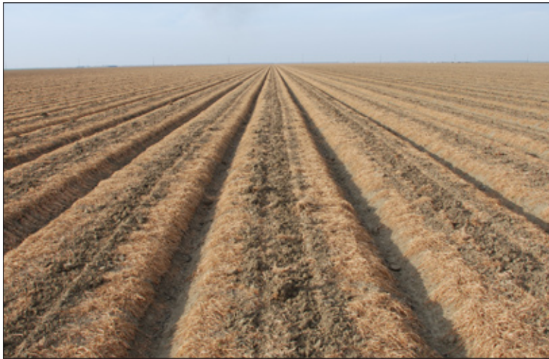
Figure 12. Strip-tilled triticale cover crop beds, Sano Farms, Firebaugh, California, 2008.