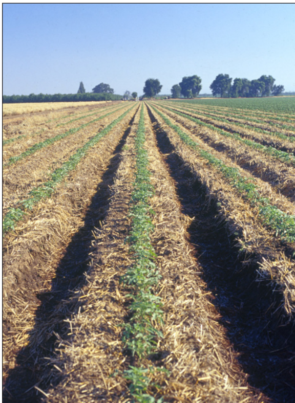
Figure 2. Strip-till transplanted fresh market tomatoes in wheat cover crop, Le Grand, California, 2001.

Minimum-till systems for tomatoes that rely on reduced-pass bed preparation and that disturb a far greater soil volume than is done in CT are discussed in a companion publication in this series, Minimum Tillage Vegetable Crop Production in California (Mitchell et al. 2004).