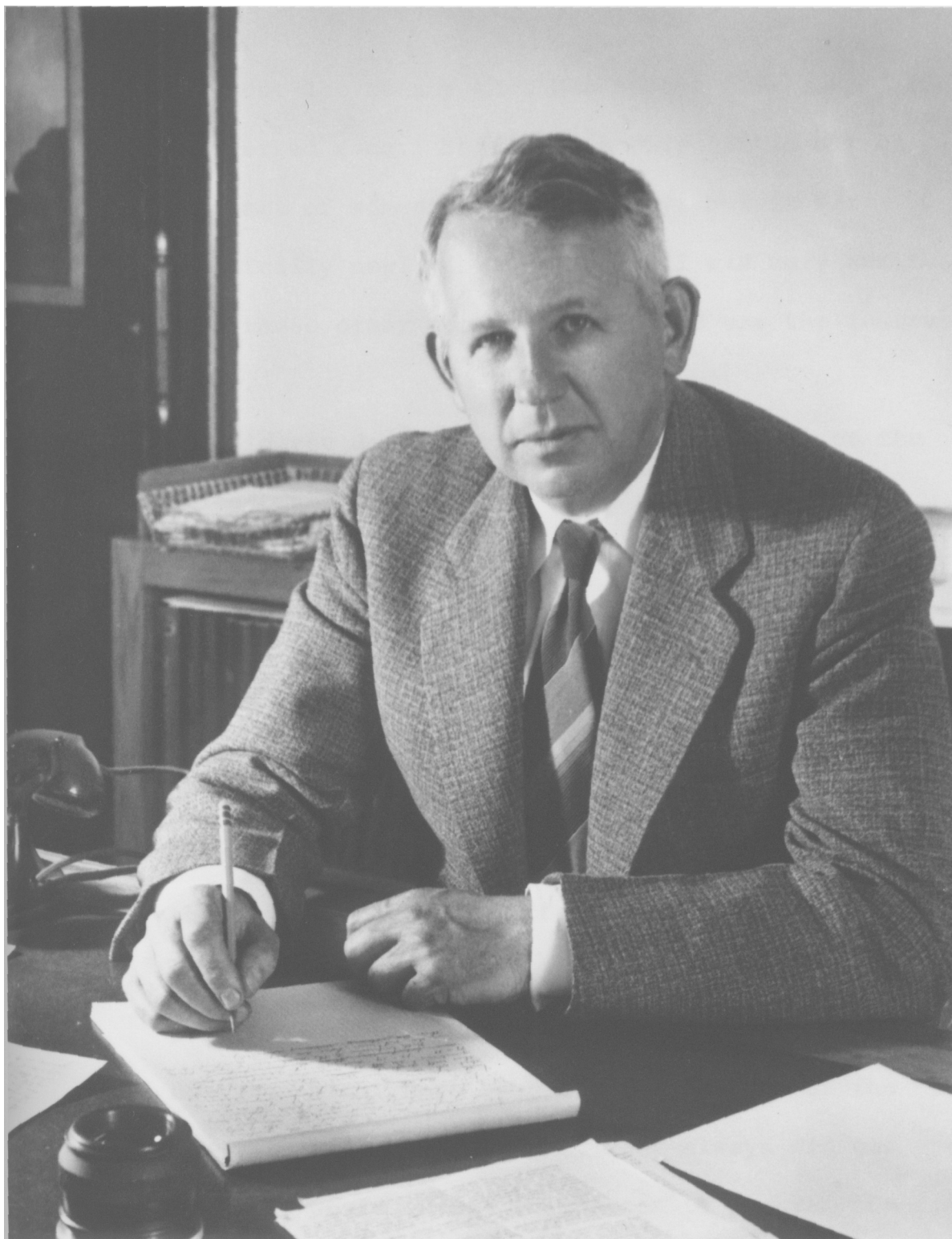
C.D. Shane At his desk in the Director's office Of the Lick Observatory, 1946