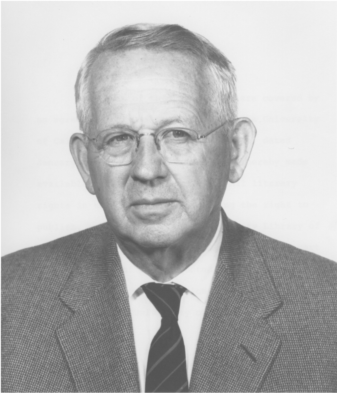
Charles Donald Shane 1964