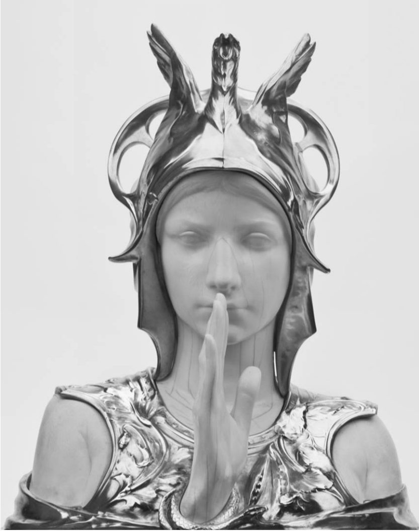
FIG. 7.—Charles Van der Stappen, Mysterious Sphinx , 1897. Ivory and alloy of copper and silver with onyx base, 56.5 × 46 × 31.3 cm. Collection of King Baudoin Foundation, Royal Museums of Art and History, Brussels. A color version of this figure is available online.

2005, 4–7, with photographs unavailable elsewhere; Françoise Aubry and Werner Adriaenssens, Philippe Wolfers, Civilisation et Barbarie (Brussels, 2002); and Werner Adriaenssens and Raf Steel, La dynastie Wolfers de l'Art Nouveau à l'Art Deco (Antwerp, 2006).