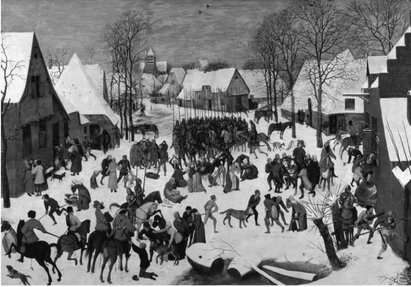
FIG. 1.—Peter Brueghel the Elder, Massacre of the Innocents , ca. 1565–67, http://commons.wikimedia.org/wiki/Category:Massacre_of_the_Innocents_by_Pieter_Bruegel_the_Elder#/media/File:Pieter_Bruegel_the_Elder_-_The_Massacre_of_the_Innocents_-_WGA3479.jpg . A color version of this figure is available online.

Writers at the time invoked a proverb that may have been part of Brueghel’s mentality when creating the picture: Dulle Griet, the folk female marauder, was said to be “plundering at the mouth of hell and emerging unscathed.” Others suggested that Brueghel again alluded to the historical period he lived through, evoking in the destructive Dulle Griet the Spanish invasion of the Low Countries. But in 1904 Belgium was itself the object of a growing firestorm of criticism for unleashing atrocities and destruction in the Congo. 9 The sweep and scoop of stuff yielded by Dulle Griet’s plundering—from household crockery, jugs, pots, and skillets to a pirate’s treasure chest—bore striking affinity to the bonanza of spoils, swooped up randomly by officers moving through the Congo interior, that shipped out and came to be displayed in the emerging Congo museum of King Leopold at Tervuren.