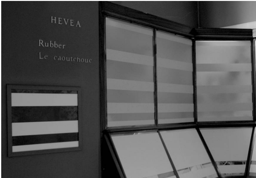
FIG. 5.—Taped over rubber ( caoutchouc ) cases in RMCA product room gallery, 2008. A color version of this figure is available online.

One way in which the Tervuren museum will rethink past and present will likely refer to international debates and models regarding colonial collections in