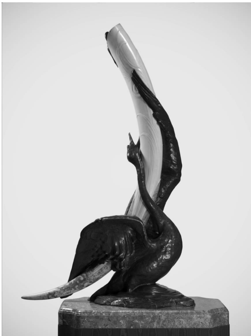
FIG. 9.—Philippe Wolfers, Caress of the Swan , 1897. Ivory and bronze, h. 173 cm. A color version of this figure is available online.