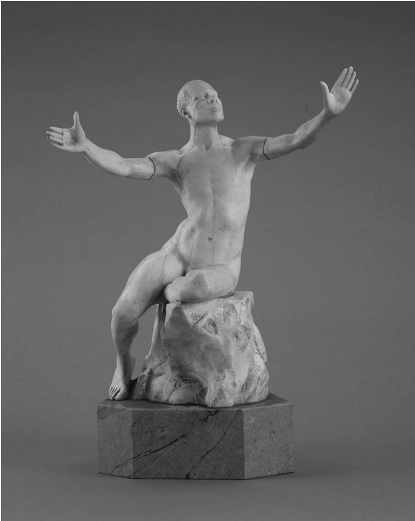
FIG. 12.—Eugène de Bramaecker, L'Esclave (The slave), 1910. Ivory, h. 24 cm. HO.0.1.293, collection RMCA Tervuren. A color version of this figure is available online.

resist. The Paris Quai Branly spawned an institution of spectacle, Disneyland reborn as The Family of Man with a postmodern twist. Objects from many areas of Africa, like those of all the continents, appear in a swirl of spotlit platforms or looming in dark cases. The Quai Branly vision of dramatic displays of all continents among equals also infuses the new Antwerp MAS Museum (Museum