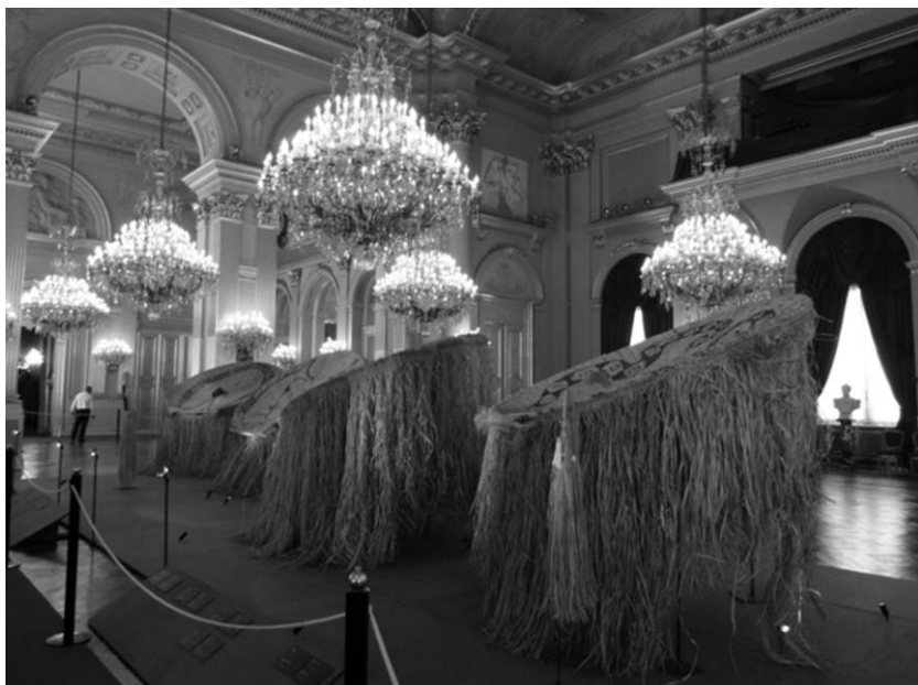
FIG. 15.—Interior of Brussels Royal Palace with installations for 2012 “Face to Face” exhibition: Mehinaku masks, twenty-first century. A color version of this figure is available online.

lections and display cases.” But the public was instructed to think also about masks in the “figurative sense,” described as the way in which “African, Asian, American and Oceanic diaspora members in the West” adopt masks as a way to cope: these groups were used to “‘putting on a good face’ in an environment where one is frequently subjected to ‘racial profiling.’”