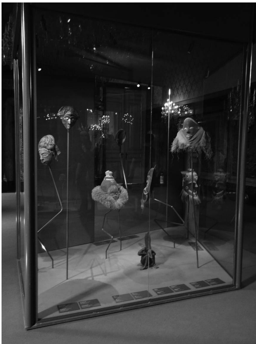
FIG. 16.—Glass case with RMCA masks in Brussels Royal Palace “Face to Face” exhibition, 2012. A color version of this figure is available online.