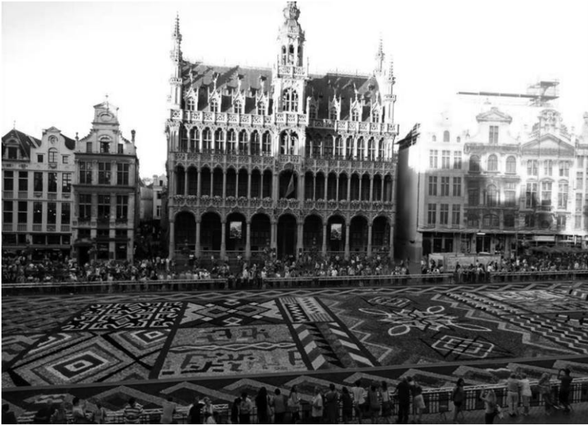
FIG. 14.—Brussels Grand Place Flower Carpet, 2012: “Africa: The Continent.” A color version of this figure is available online.

universalism in the heart of King Leopold’s Royal Palace. In August 2012 the once-a-year opening of the Brussels palace to the public included an inaugural temporary exhibition devoted to the theme “Face to Face.” Rather than the typical tour through the royal chambers and galleries, visitors moved along into the opulent throne room and were presented with a long, spotlit platform showing a series of “ethnic” ceremonial masks, in straw and wood, from Brazil—labeled “21st Century Mehinaku.” Nearby were installations of portrait paintings by Belgian artists; across from these was an array of masks, mounted on zigzagging wire poles, from New Guinea, Nigeria, ancient Mexico, Liberia, and the DRC, among other places. The architectural setting, lit by multiple, massive thickets of low-hanging cut crystal and gilded chandeliers, was the product of the 1902–8 renovation by King Leopold II, paid for with his Congo crown treasury, just as the Girault Tervuren museum palace of 1904–10 had been. Now the royal domain was occupied by global, tribal, and Belgian artifacts of playful misrule that spanned centuries, continents, and cultures (fig. 15).