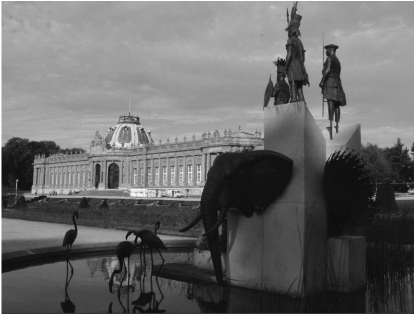
FIG. 4.—Tom Frantzen, The Congo I Presume? Statue and sculpture group, 1997. A color version of this figure is available online.

crania and tusks on shelves and on the floor, some arranged in a semicircle to frame a giant elephant skull and jaw with intact tusks mounted high on a post. 33