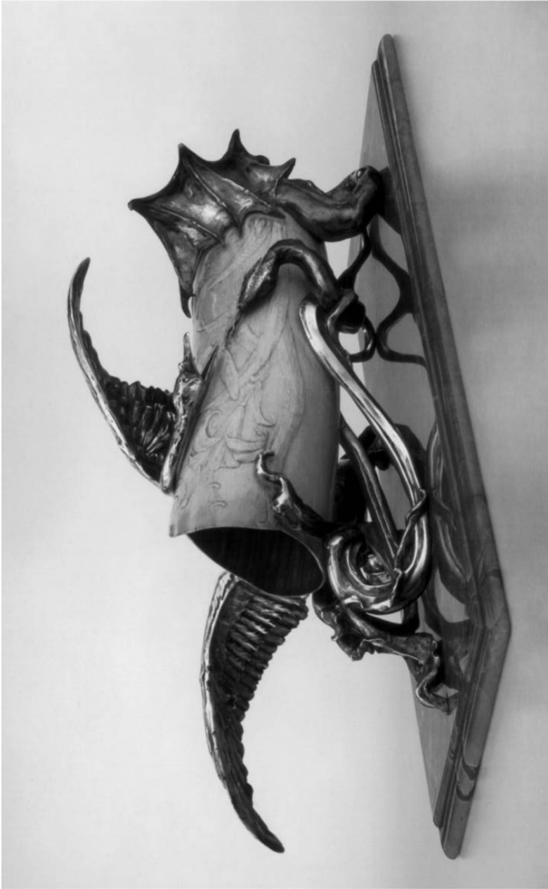
FIG. 11.—Philippe Wolfers, Civilization and Barbarism , 1897. Ivory and silver with onyx base, 46 × 67 × 26.5 cm. Collection of King Baudouin Foundation, Royal Museums of Art and History, Brussels. A color version of this figure is available online.