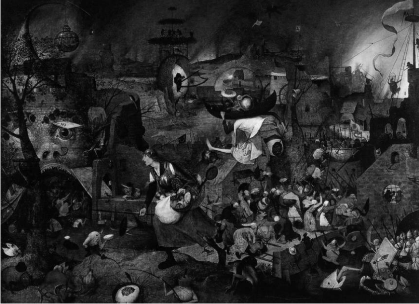
FIG. 2.—Peter Bruegel the Elder, Dulle Griet (Mad Meg), 1562, http://www.wikiart.org/en/pieter-bruegel-the-elder/dulle-griet-mad-meg-1564#supersized-artistPaintings-186745 . A color version of this figure is available online.