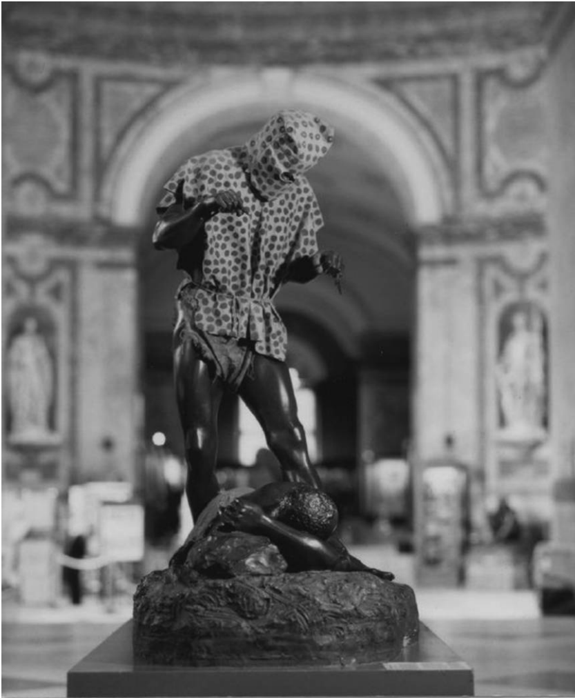
FIG. 3.—Paul Wissaert, Leopard Man , 1913. HO.0.1.371, collection RMCA Tervuren. A color version of this figure is available online.

Tervuren, Georges Rémi, known as Hergé, adapted the figure as a character in his 1931 Tintin au Congo . Like the artist Paul Wissaert and King Leopold II before him, Hergé had never set foot in the Congo. Thus, for almost a century, a wall of silence reigned regarding the millions of natives who died under Belgian rule, while millions of museum visitors beheld a dramatic embodiment of a Congo tribesman caught in the act of killing one of his own people.