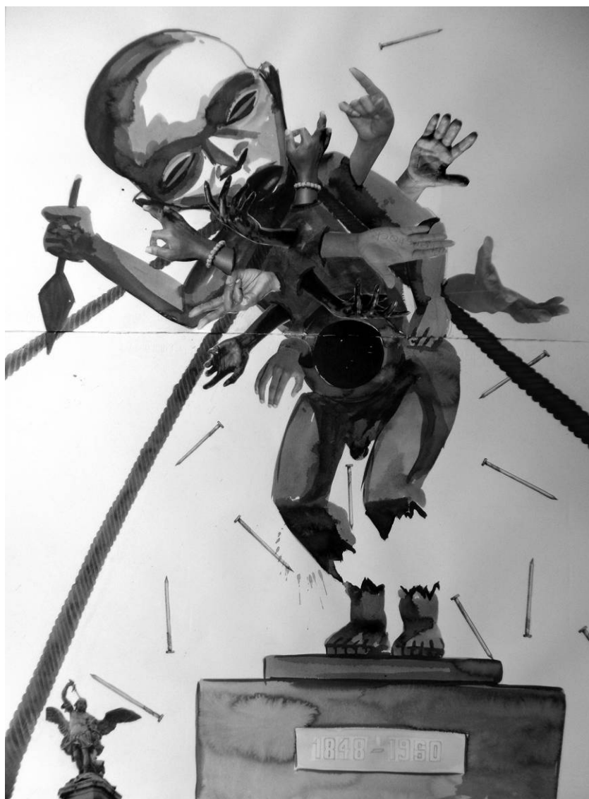
FIG. 18.—Steve Bandoma, Trésor oublié (from the Lost Tribes series), 2011. Watercolor/mixed media on paper, 100 × 140 cm. Collection of the Samuel P. Ham Museum of Art. A color version of this figure is available online.