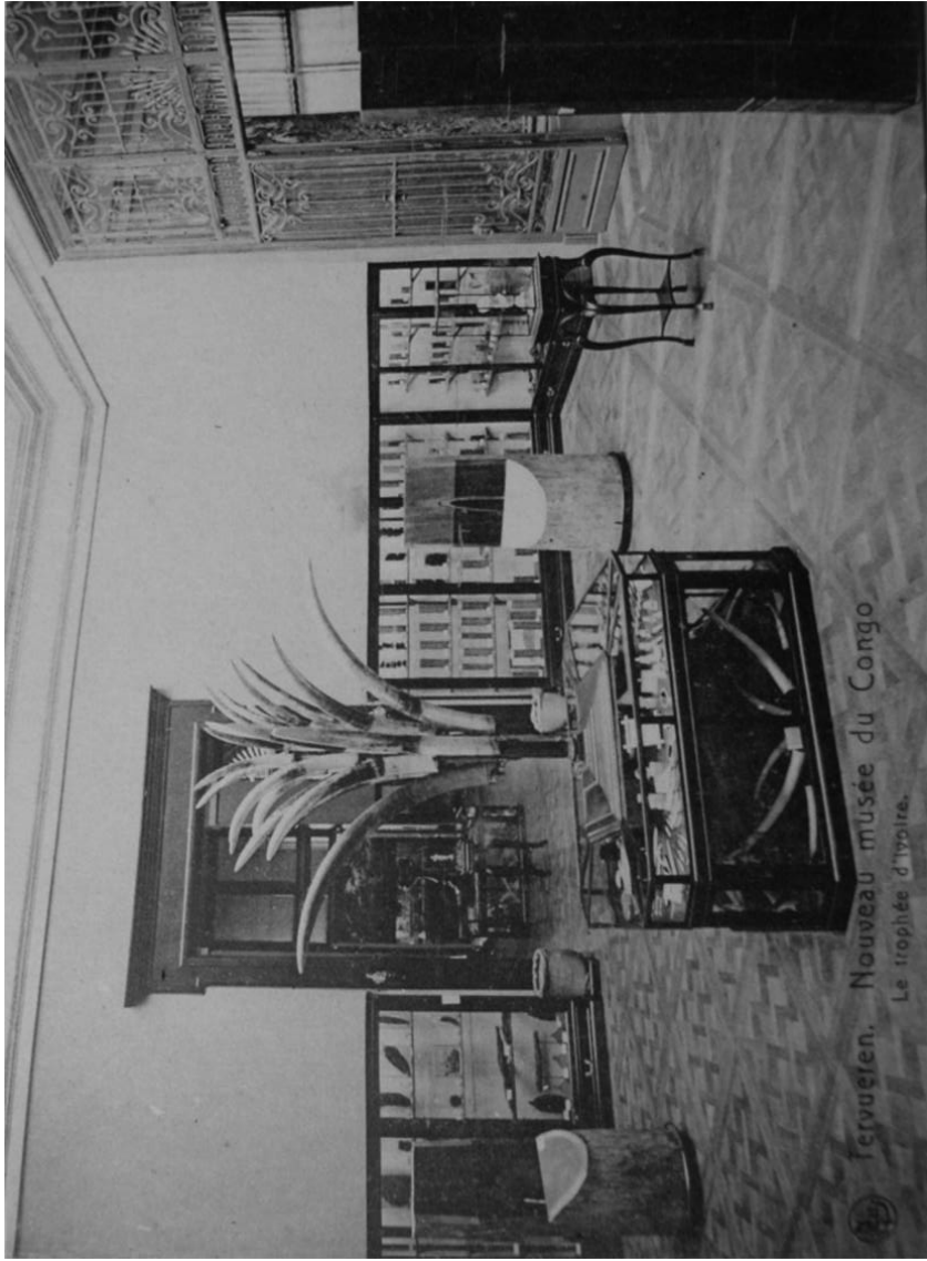
FIG. 8.— Le trophée d'ivoire (Ivory trophy), Product Room, Tervueren Congo Museum. Postcard, n.d.