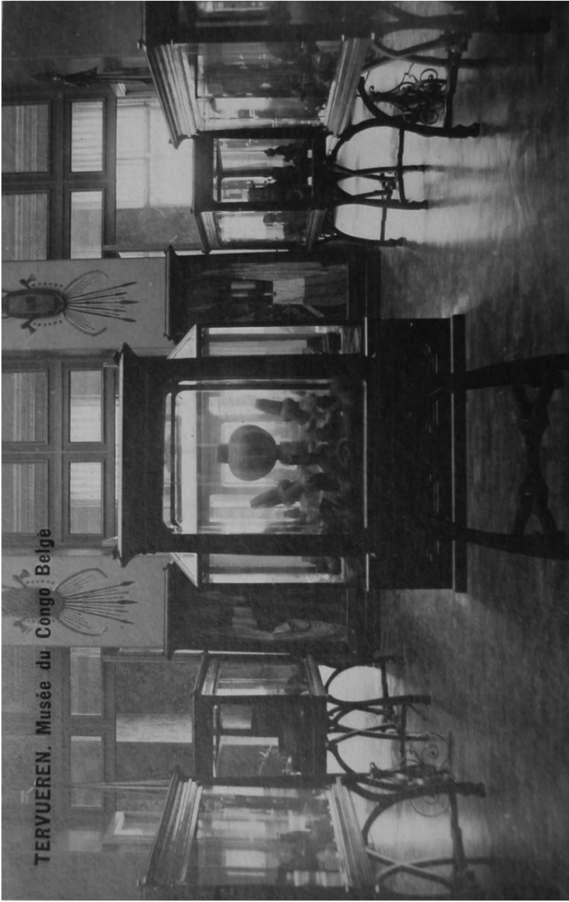
FIG. 6.—Gustave Serrurier-Bovy's display cases in Royal Museum. Postcard, n.d.