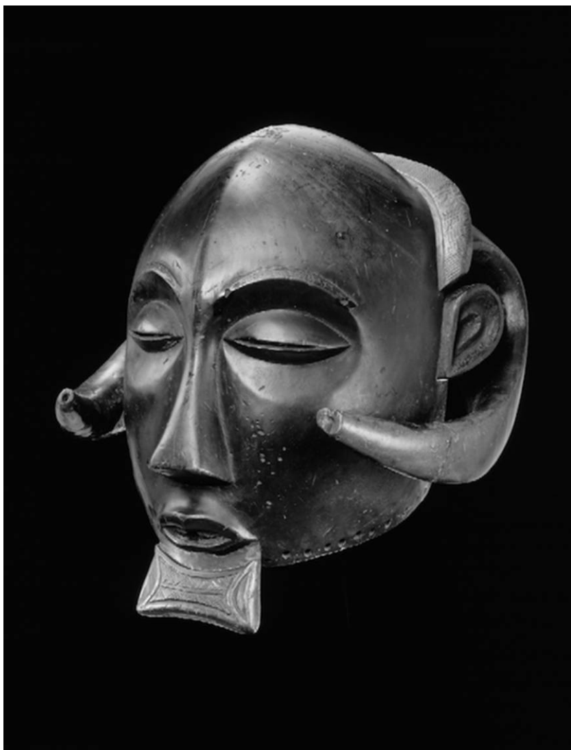
FIG. 17.—“Baluba”/Luba mask with horns and bird, nineteenth century. Wood, h. 39 cm. EO.0.0.23470, collection RMCA Tervuren; A color version of this figure is available online.