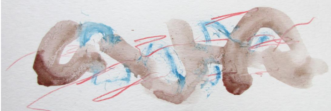
Buzzing Calligraffiti #2, 2020, photo by the artist. Material: acai juice, sumi ink, blue watercolor, color pencils on paper. Dimension: 12.7x30.48cm.