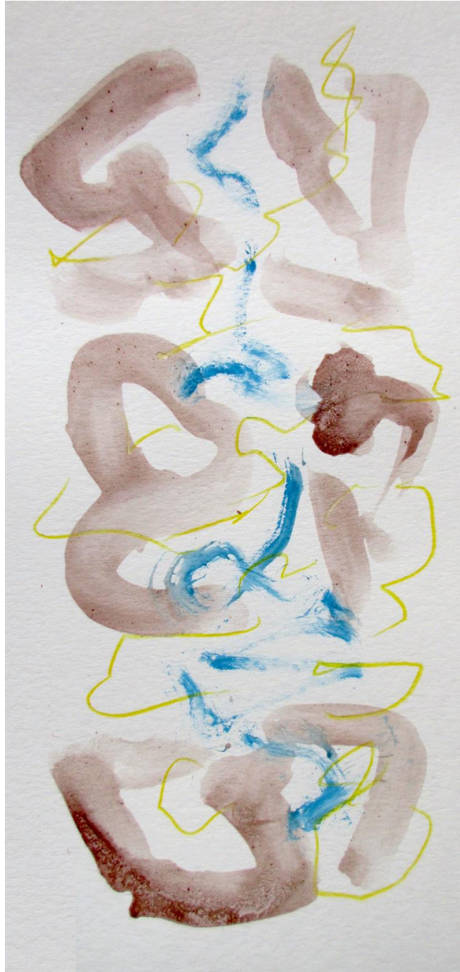
Buzzing Calligraffiti #3, 2020, photo by the artist. Material: acai juice, sumi ink, blue watercolor, color pencils on paper. Dimension: 25.4x7.62cm.