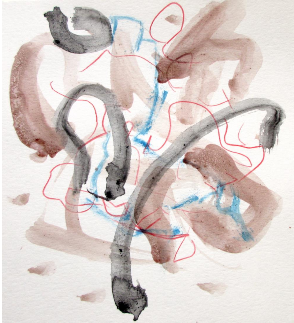
Buzzing Calligraffiti #1, 2020, photo by the artist. Material: acai juice, sumi ink, blue watercolor, color pencils on paper. Dimension: 7.62x30.48cm.