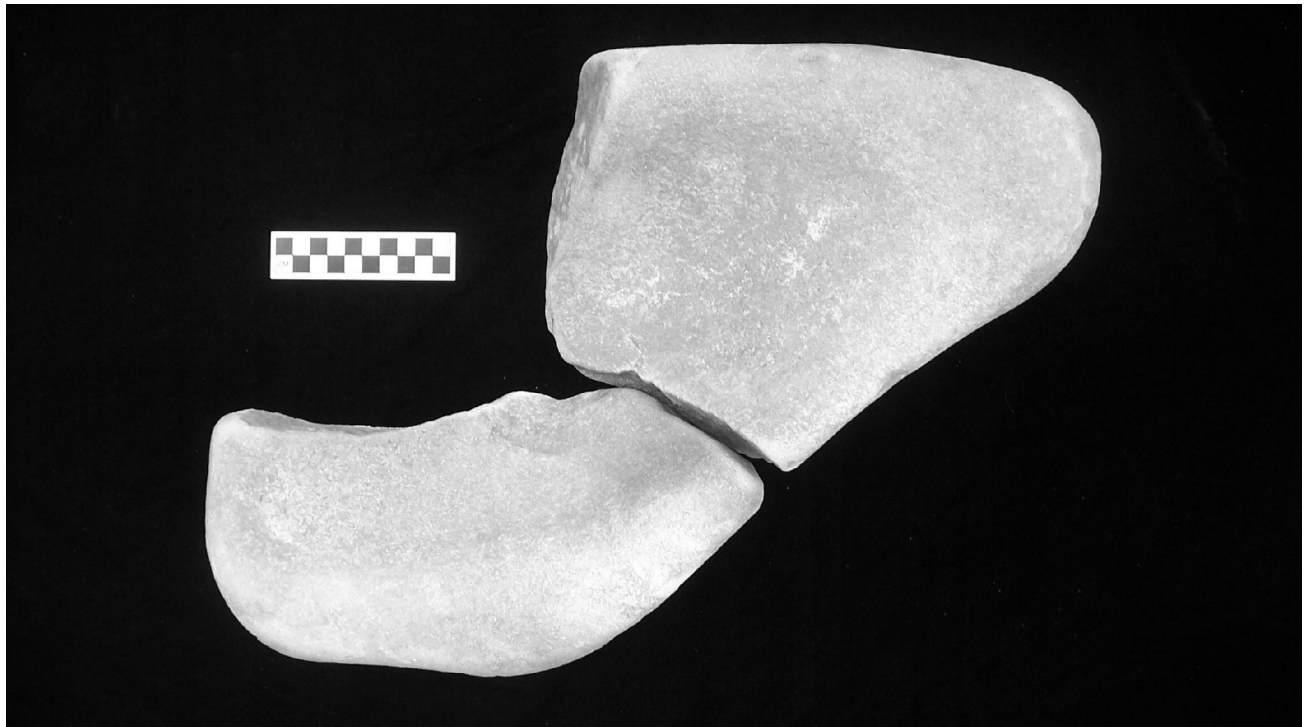
Figure 3. Metate fragments used as a cairn in the Feature 17 dog burial at Ora-1055.