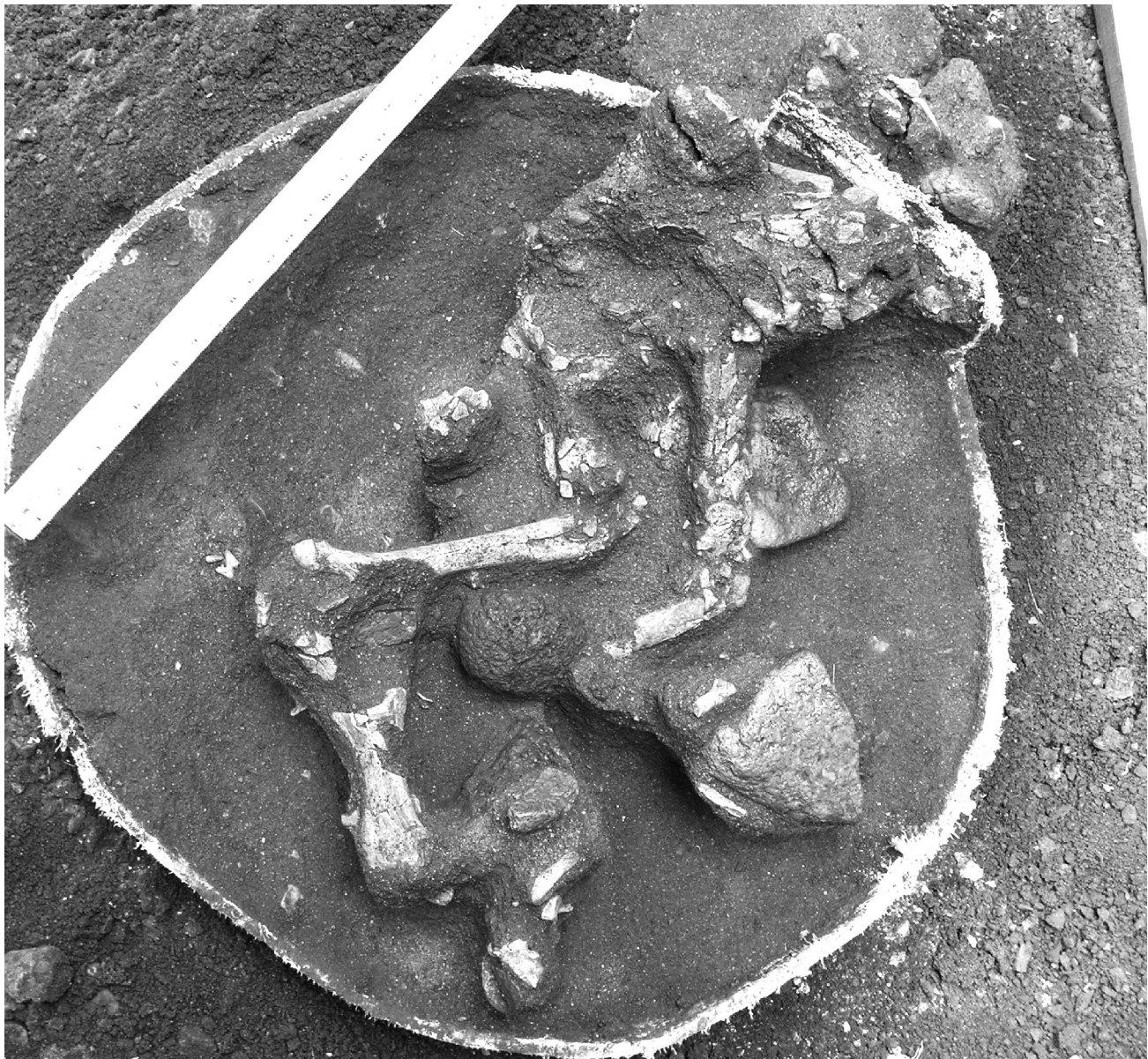
Figure 2. Ora-1055, Feature 17 dog burial exposed in plaster jacket.

which seems to have influenced the depth to which the grave pit was excavated.