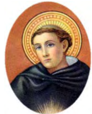
Saint Nicolas of Tolentino

sition trials in order to examine the everyday experiences of women and men alongside the unstable character of repression, local levels of tolerance, changing notions of heresy and criminality, erotic expressions of religiosity, and the boundaries between humans and animals. I am primarily concerned with the Spanish colonial regulation of those sexual practices deemed "unnatural" in the Bible and by the early Church Fathers like Saint Augustine and medieval theologians like Thomas Aquinas. As early as the fifth century, for example, Saint Augustine had deemed unnatural and sinful those sexual acts that did not take place in a "vessel fit for procreation." 2 Regarding sodomy, bestiality, masturbation, and seemingly unnatural sexual positions between men and women—all classified as