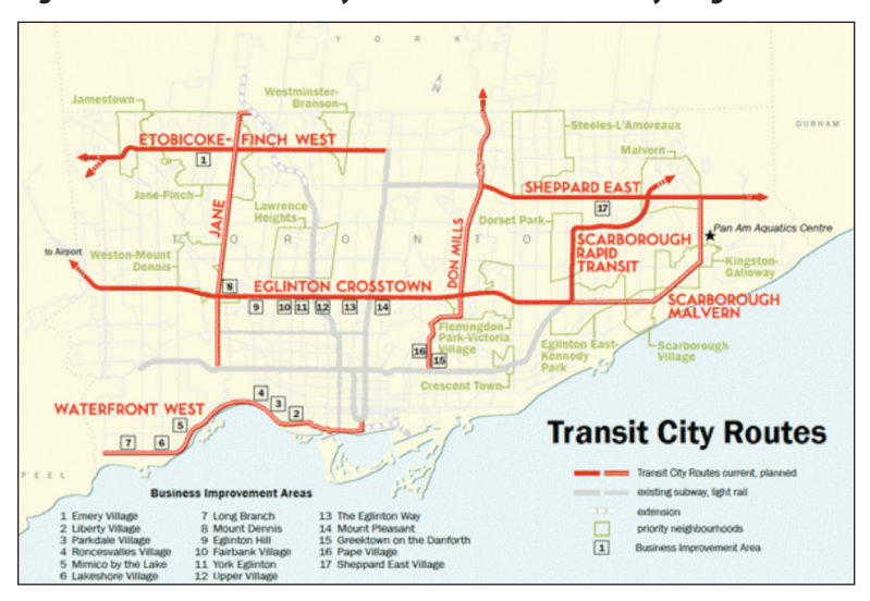
Figure 3: Planned Transit City Lines and Thirteen Priority Neighborhoods