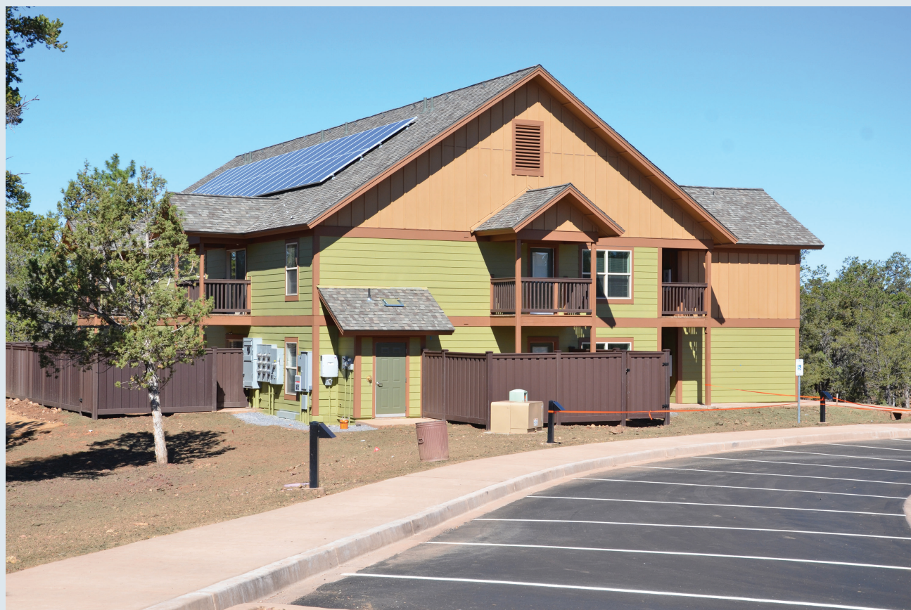
Multi-family employee housing at Grand Canyon National Park.

The chronic inability to fill seasonal jobs has knock-on effects that can derail park improvements large and