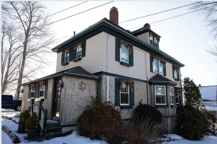
LEFT A former inn in Southwest Harbor, Maine, will now provide housing for up to 10 seasonal employees at Acadia National Park. RIGHT NPS officials cut the ribbon at a ceremony celebrating new employee housing.