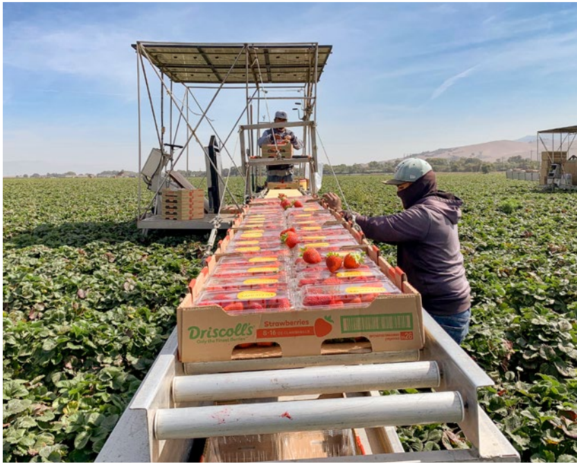
From 2010 to 2020, the number of certified H-2A jobs in the United States more than tripled, from 75,000 to over 275,000. A proposal to freeze the adverse effect wage rate could speed the growth of the H-2A visa guest worker program even further.

and collect the farmworker earnings data used by the DOL to set AEWs. Meanwhile, on November 5, 2020, the DOL published a final regulation that froze AEWs for 2021 and 2022 at their 2020 levels and ended reliance on the FLS to adjust these AEWs in the future. The same federal judge who ordered the USDA to resume the FLS program earlier in the year blocked the DOL from implementing this final regulation, which was withdrawn by the Biden Administration on January 20, 2021.