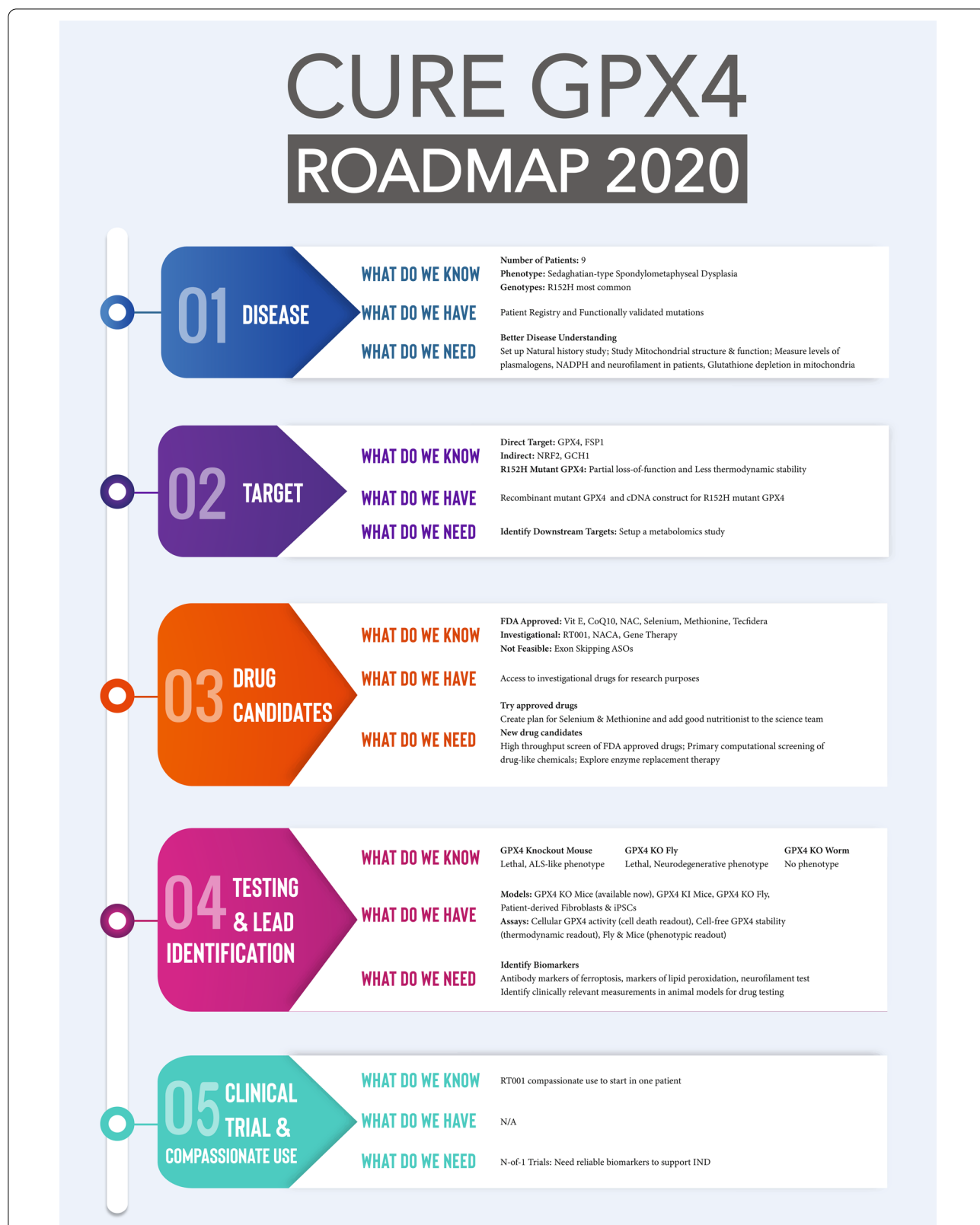
Fig. 2 GPX4 Roadmap 2020. Roadmap for GPX4-related disease therapy development