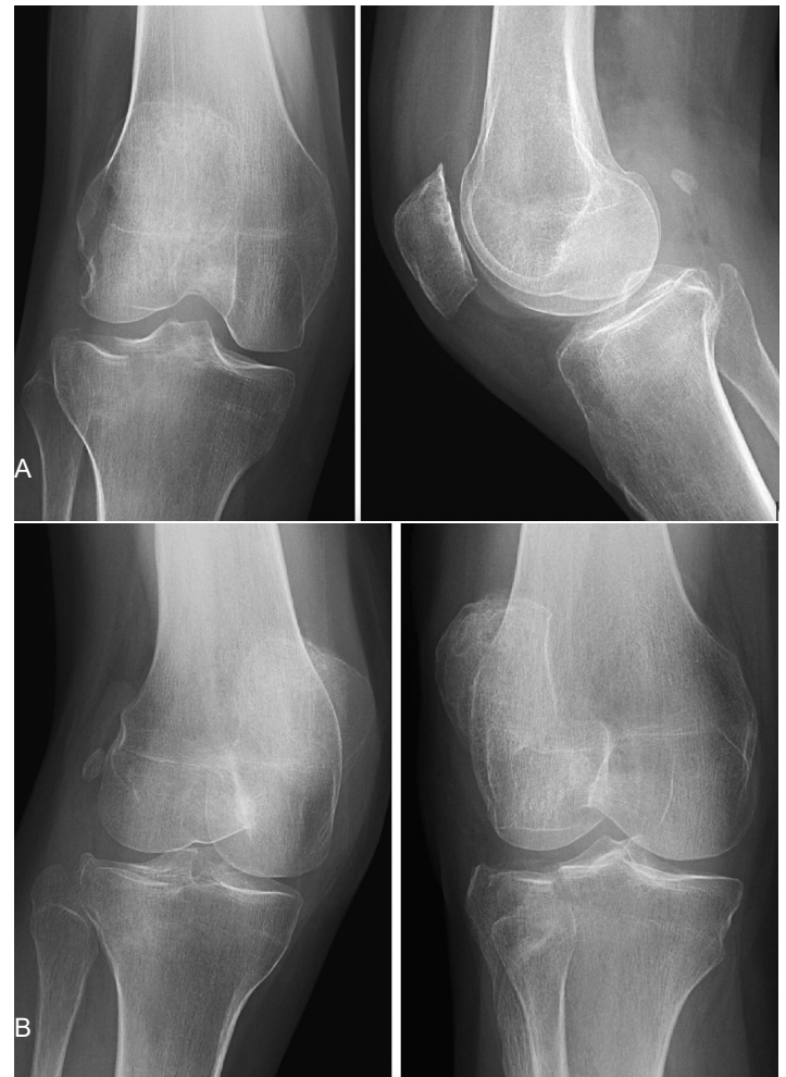
Figure 2. (A) Orthogonal radiographs (two-view) of one “critical miss” that was initially recommended to be best managed with nonoperative treatment but then later was recommended for operative management with the addition of oblique radiographs. Seen to have a lateral tibial plateau fracture. (B) Oblique radiographs (four-view component) of one “critical miss” that was initially recommended to be best managed with nonoperative treatment but then later recommended for operative management with the addition of oblique radiographs. Seen to have a lateral tibial plateau fracture.

from the femur and any tibial plateau abnormalities. 12 While additional radiographic views or tests should be expected to improve detection, the added value of these studies must be assessed against potential costs, clinical or economic, that the studies incur. Furthermore, depending on the suspected injury, there may be more beneficial imaging that targets the suspected location or type of injury, including a caudal tilt plateau view for tibial plateau fractures or an escalation to cross-sectional imaging. 13-15