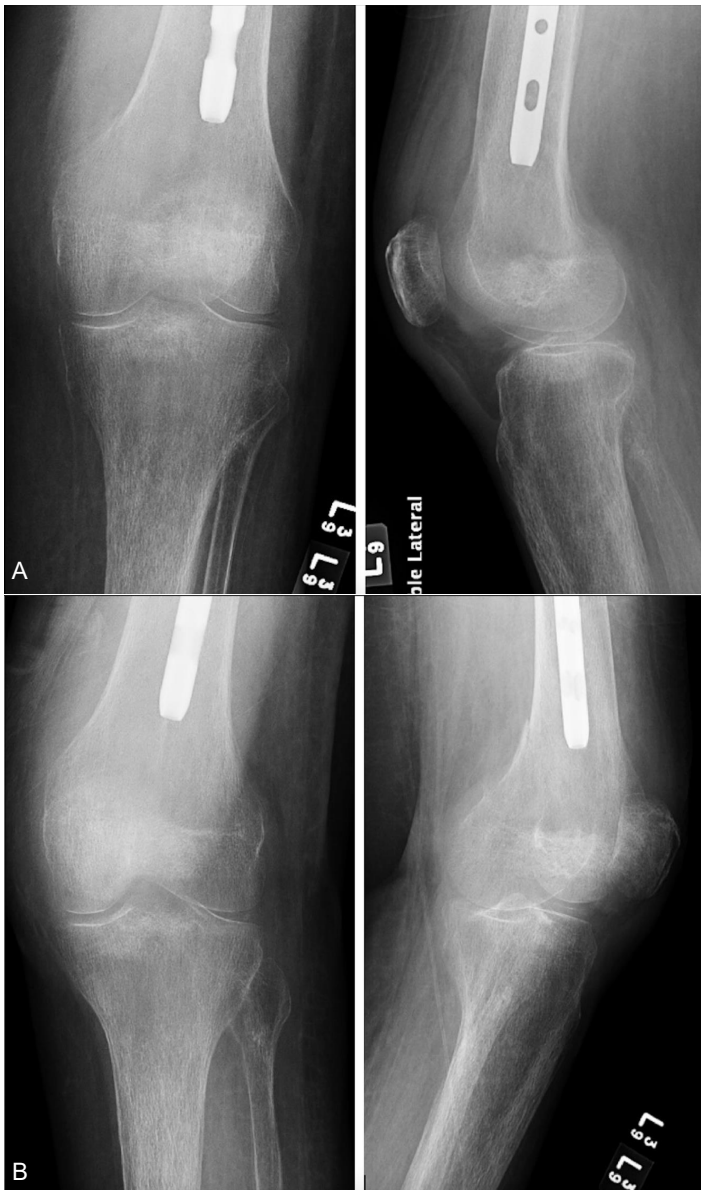
Figure 1. (A) Orthogonal radiographs (two-view) of one “critical miss” that was initially unidentified on orthogonal radiographs and then later identified as requiring operative management with the supplement of oblique radiographs. Seen to have a distal femoral metaphysis fracture. (B) Oblique radiographs (four-view component) of one “critical miss” that was not identified on orthogonal radiographs and then later identified as requiring operative management with the supplement of oblique radiographs. Seen to have a distal femoral metaphysis fracture.

from the femur and any tibial plateau abnormalities. 12 While additional radiographic views or tests should be expected to improve detection, the added value of these studies must be assessed against potential costs, clinical or economic, that the studies incur. Furthermore, depending on the suspected injury, there may be more beneficial imaging that targets the suspected location or type of injury, including a caudal tilt plateau view for tibial plateau fractures or an escalation to cross-sectional imaging. 13-15