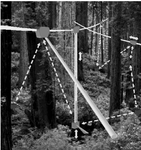
Fig. 2. A schematic view of NIMS, showing mobile nodes suspended on cable infrastructure and its capability for communicating and transporting wireless nodes throughout a three-dimensional volume to provide a network topology adapted to time-varying environmental characteristics.

placed to benefit communication, but, are not in a position to harvest energy.