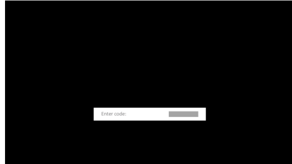
Figure 2. A screenshot of the code output box screen

Thus, in addition to completing the steps of the UNRAVEL task, participants also needed to maintain the new code in memory until prompted to output the code several steps later. Pilot testing with a different interruption task had revealed a ceiling effect; thus, the purpose of the code memorization task was to increase participants’ mental workload during the UNRAVEL task and decrease accuracy in the no interruption condition.