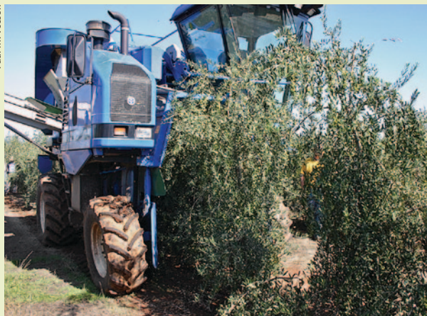
Super-high-density hedgerow planting systems for olives employ over-the-row harvesters (shown, in California).

Vegetation. In December 2009, the average tree height had reached 107 inches, 5.3 times the initial growth of the previous year, with a maximum of 7.6 times more growth for 'Arbequina' and a minimum of 2.2 times more for 'Urano' (table 1). Only the crown width of 'Coratina' exceeded 79 inches by