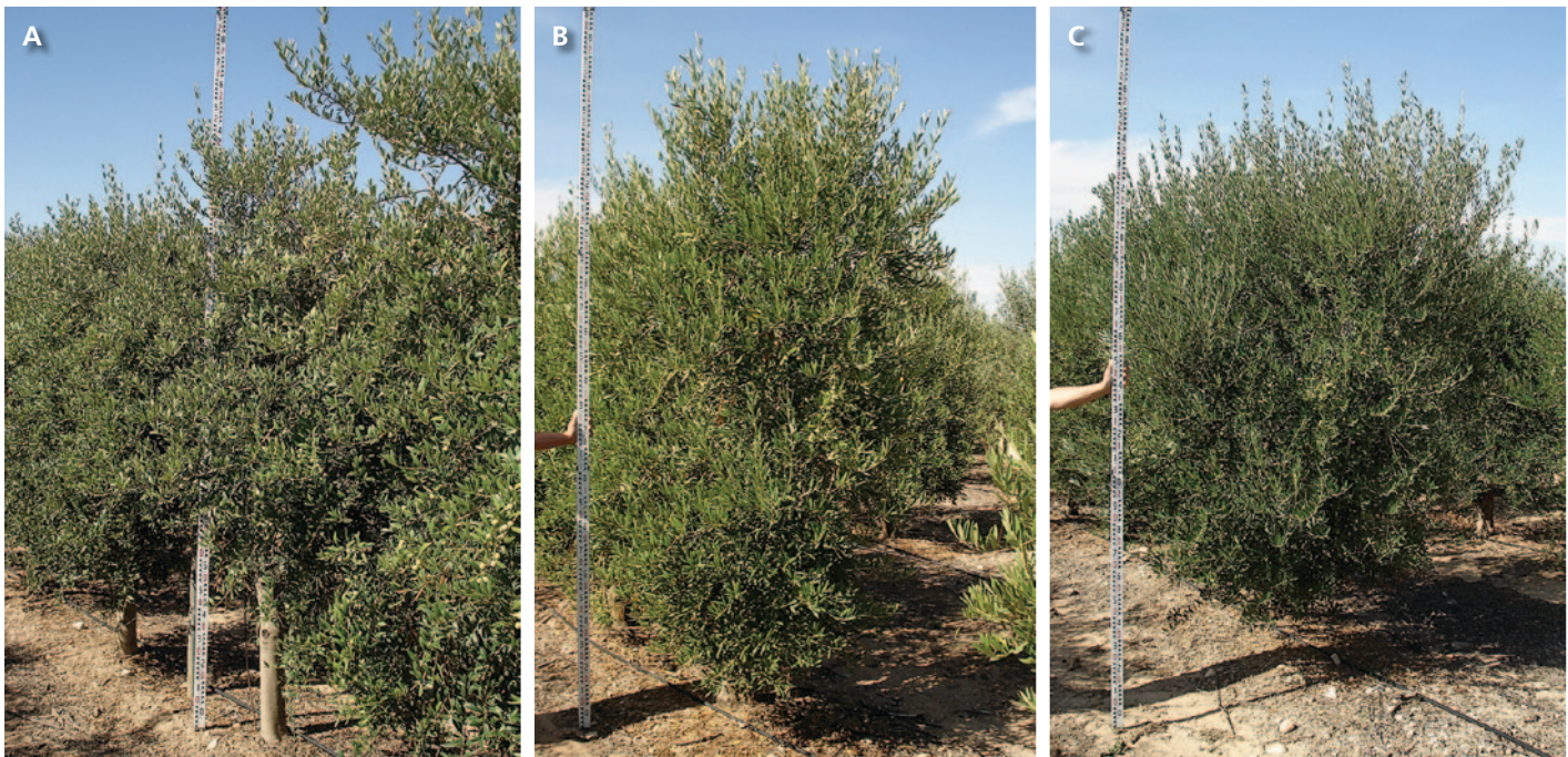
The growth habit of 11-year-old trees is shown for the IRTA clones (A) 'Arbequina i-18' (B) 'Arbosana i-43' and (C) 'Koroneiki i-38', in a hedgerow, super-high-density planting system in 2009, in Spain.

The first comparative field trial with these clones in super-high-density hedgerow orchards was planted in