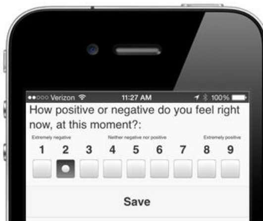
Figure 1. Interface of a mood probe in MoodAdaptor

“How positive or negative do you feel right now, at this moment?” (with response categories on a 9 point scale ranging from “extremely negative” to “extremely positive” and a neutral response of “neither negative nor positive”). See Figure 1 for a screenshot of a mood probe.