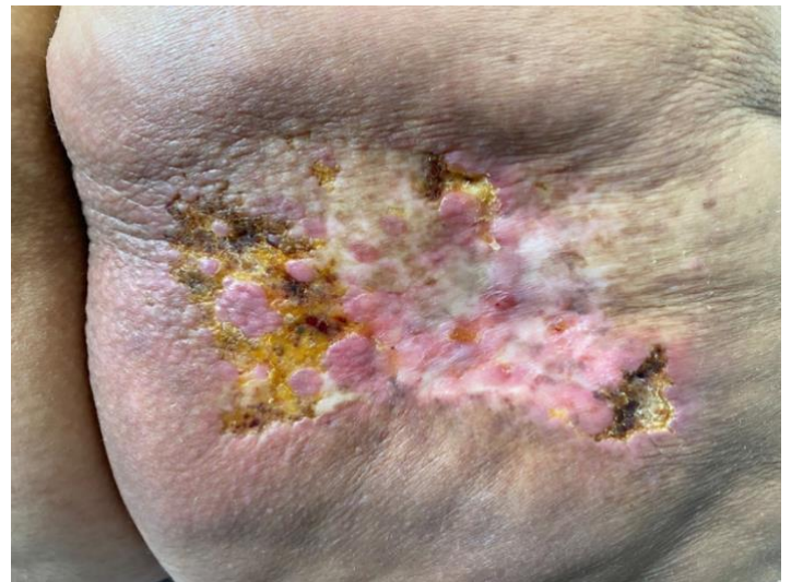
Figure 1. A large fibrotic plaque on the patient's right gluteal region with areas of ulceration covered by crusts.

In conclusion, repeated intramuscular diclofenac injections can lead to treatment-resistant fibrotic ulcers of Nicolau syndrome. Colchicine, because of its antifibrotic effects, may help in the management of the disorder.