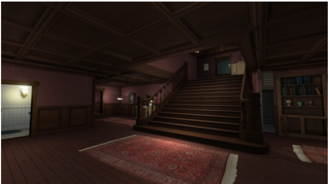
Figure 10 - Gone Home , Fullbright, 2013

While Assassin's Creed 2 allowed for multiple open forms of attention and Bioshock focused on linear singular forms of attention, Gone Home operates somewhere in the interstitial space between the two. The entire game can be completed in one minutes (there is even an in-game achievement for doing so), yet a typical first play through will take between two to three hours. Players are free to concern themselves only with advancing the plot and finding their family, but more careful and curious players are rewarded for taking their time and investigating further. The family of the player character, recently moved into this new home while she was away studying abroad, as a result, neither the player nor the in-game character is familiar with the layout of the home. The game begins with the player entering a colonial style house at night in the middle of a