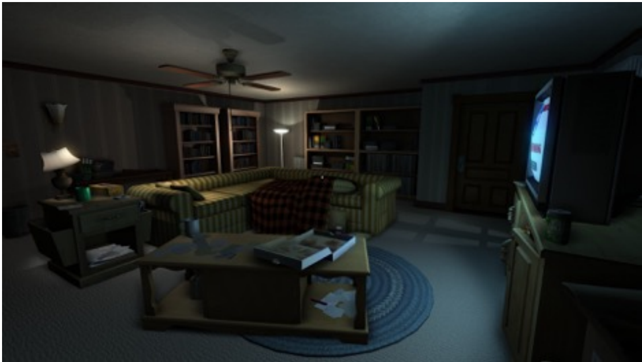
Figure 11 - Gone Home , Fullbright, 2013

evidence trail is virtual, mobile, and protected by passwords. The world of 1995 is populated with postcards, hand written notes, physical mail, cassette tapes, and love letters, (fig. 11) objects that are rare if not extinct in 2013. A ticket stub to an Earth, Wind, and Fire concert, a magazine cover depicting Jodie Foster, empty pizza boxes, class notes, and diaries are all essentially representational, they work much in the same way as Flaubert's barometer, they populate the game with history, situate it in a place and time and offer an insight into those that inhabit it. Yet, they do far more than that, the nature of Gone Home as a game allows them to transcend a single form of attention. As Bishop argues, similar to Brechtian theatre, these pieces of ephemera rely a message to the player, forcing them to step outside the role of passive observer and occupy the position of critical thinker. Gone Home is not a game about skill, it is a game about thinking, analyzing, and discovering the truth. One can be immersed in the representation of a hidden note