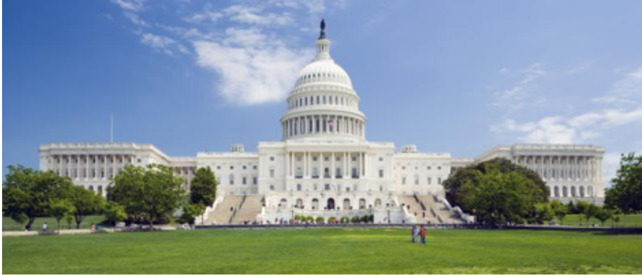
Figure 1 - U.S. Capitol Building, William Thornton, 1800

“The Metropolis and Mental Life” in which Simmel focuses on the city as a realm of social interaction and a vehicle for individual freedom. Yet, while freedom may be enhanced, the city also “forces urban dwellers to become impersonal, reserved, indifferent, blasé, and calculated as a means of protection from over-stimulation.” 27