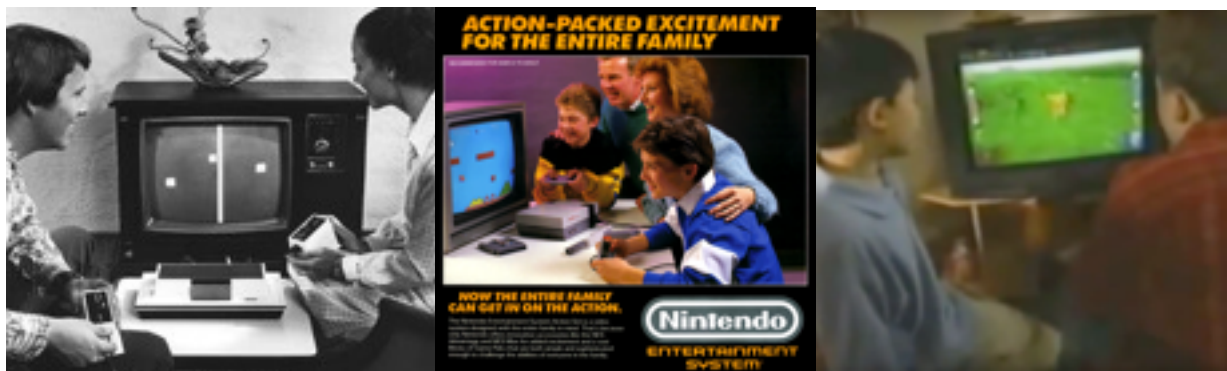
Figure 13 - From Left to Right - Advertisements for the Magnavox Odyssey, Nintendo Entertainment System, and Nintendo 64

multiple people playing consoles. In fact, Nintendo famously had more success marketing and selling their first console in Japan once they rebranded it the Famicom (short for family computer).