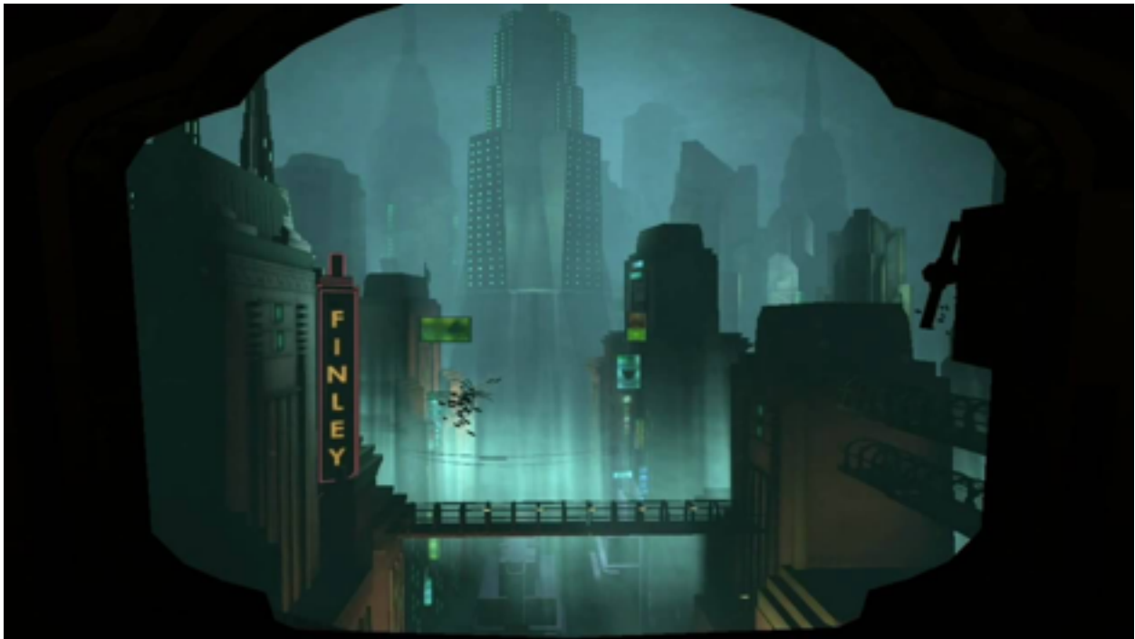
Figure 7 - Bioshock , 2K Games, 2007

For an underwater city, Rapture is surprisingly familiar. Founded in the 1920s the city is an Art Deco masterpiece. Towering buildings rise up from the sea floor, signs lit up in lights litter the facades, and bold geometric shapes and lavish interiors populate the architecture inside and out (fig. 7). As an underwater city, Rapture has no need for towering buildings or exterior ornamentation of any kind. The game takes place entirely indoors and while exterior signs and advertisements are sometimes viewable from windows they are frequently obscured and