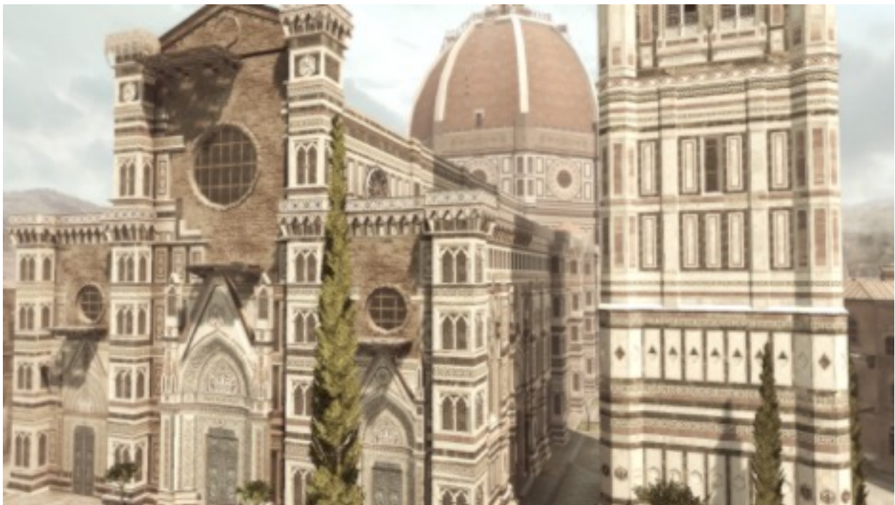
Figure 5 - Assassin's Creed 2 , Ubisoft, 2009

Looking in particular to the portrayal of the city of Florence in the game it is apparent that develop Ubisoft uses architecture first and foremost as both its referent and its example of “concrete reality,” both types of “reality effects” that Barthes discusses. Take for example the biggest landmark in all of Florence, the Cathedral of Santa Maria del Fiore. The important thing to realize about a referent is that it only works if one is familiar with what is being referenced.