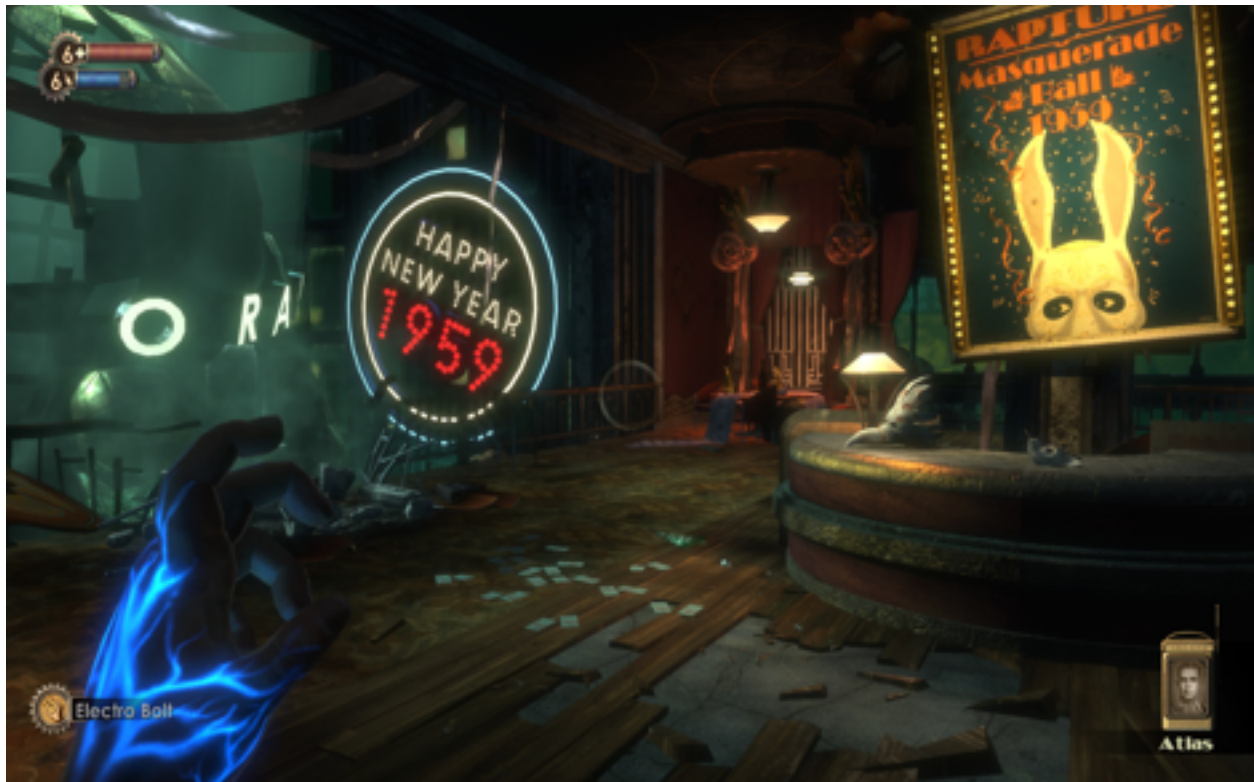
Figure 8 - Bioshock , 2K Games, 2007

game's release. Rapture, far more than the player character Jack, or the megalomaniac Andrew Ryan is the true protagonist of the game. Similar to the thoughts Onyett echoes, what truly separates Rapture is the details. The hints of a wild night out, the details of an operation gone wrong, the fallout of a civil war yet to be resolved all tell the player things about Rapture without the need to read or utter a single word (fig. 8). What could easily pass off simply as representational attention here actually functions in a participatory manner as well. Bioshock does not comply to any one particular videogame genre yet it certainly contains aspects of survival horror. The weapons, ammunition, powers, and health are scarce while the enemies are fast, powerful, intimidating, and plentiful. The game wants players to be afraid, it intentionally taps into traditional fears to make the player timid and careful. A blood smear on the wall, a mutilated