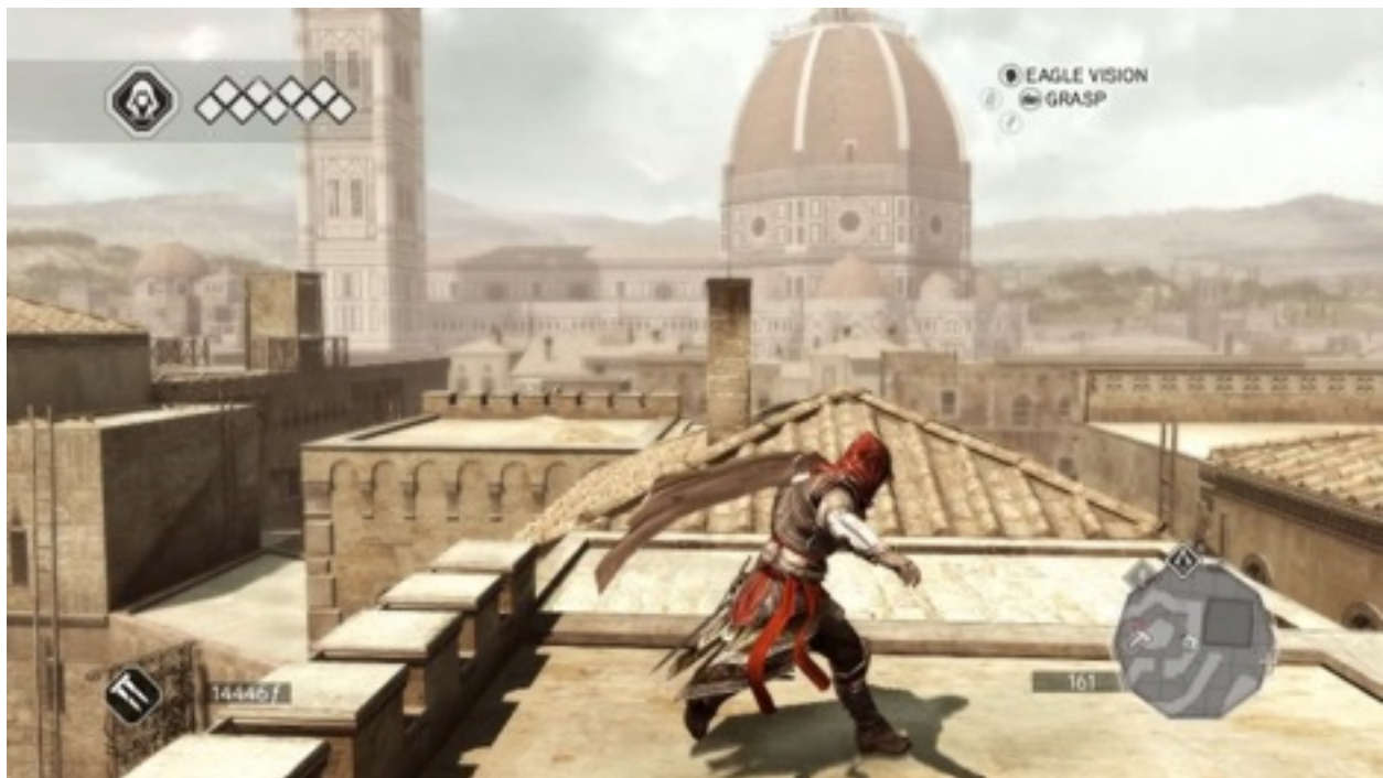
Figure 4 - Assassin's Creed 2 , Ubisoft, 2009

The game is what is referred to as an “open-world, third-person action game.” Third-person indicates that the “camera,” or rather the player’s perspective, is situated slightly behind and above the player character (fig. 4). This allows for one to have a better awareness of their surroundings. More importantly, open-world, from the standpoint of the gamer, means that players are given relative freedom to go where they wish when they wish and are able to complete tasks set before them in any number of ways or ignore tasks altogether. Yet in the context of videogames and immersion, “open-world” functions differently. A more fitting classification in this instance would be “open forms of attention” meaning that because the game