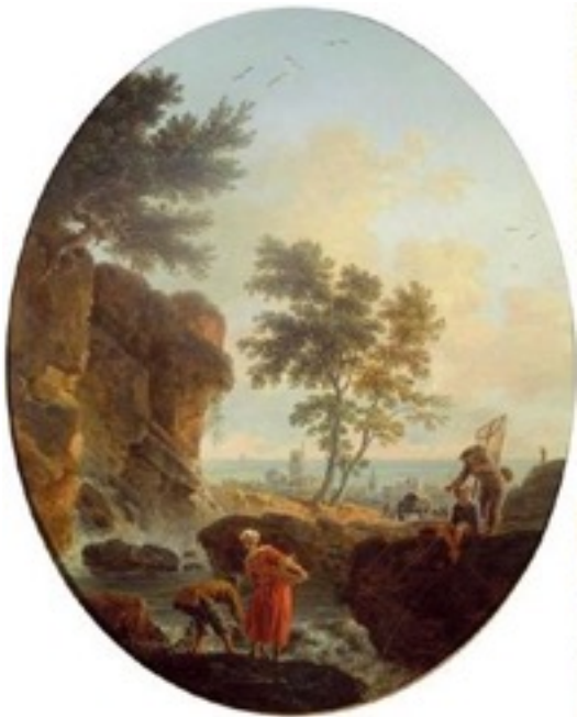
Figure 3 - La Source Abondante , Claude-Joseph Vernet, 1767

The “enchantment” he describes is the phenomenon of becoming absorbed in a work of art. In his case, he quite literally finds himself within the paintings. Diderot becomes enraptured with the scene, he imagines himself interacting with the figures in the scene, enjoying the music they