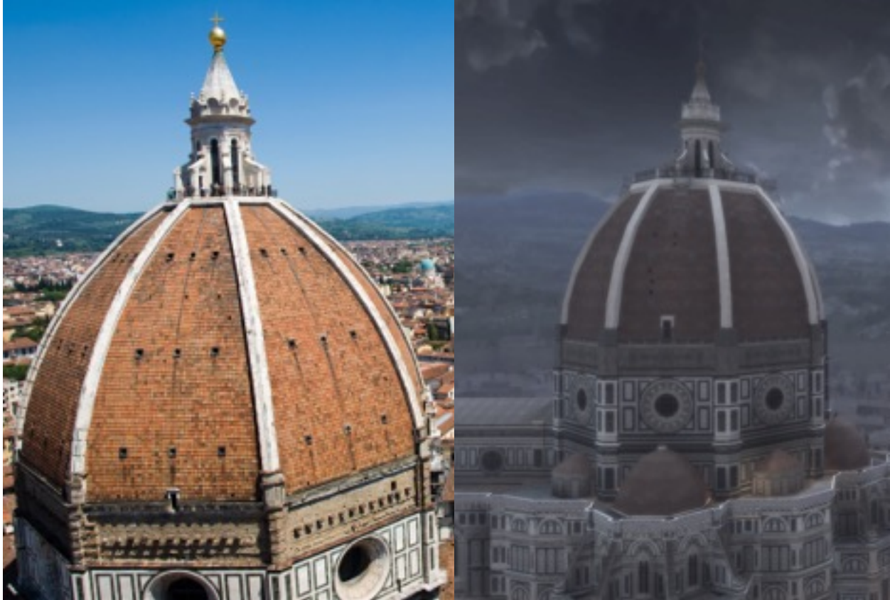
Figure 6 - Left: Brunelleschi's dome for the Cathedral of Santa Maria del Fiore. Right: Assassin's Creed 2's depiction of the dome

2 values gameplay more than representation and because a main facet of gameplay involves climbing buildings and monuments it is imperative that when one reaches the cupola that it feels similar to how it does in reality, a feat that, given the scaling down of the entire cathedral, is only possible by manipulation of its proportions.