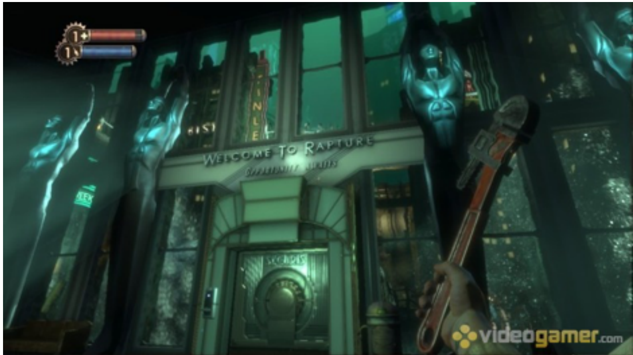
Figure 9 - Bioshock , 2K Games, 2007

one place to aim and shoot your weapon. Open spaces allow for much more dynamic fights. Player can use environmental cover, flank enemies, or be bombarded from all directions. When the dust has cleared (or, more accurately, when the gun barrels stop smoking) the frenetic action gives way to contemplative pause and exploration. Players must loot the bodies of fallen enemies, search every corner of the room, and prepare themselves for the next firefight.