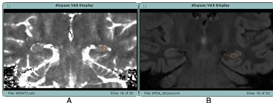
Fig. 1. Placement of ovoid ROIs on hippocampal slices of T2 map A and T2 FLAIR (B) images (Bartlett et al., 2007).

We applied the same method of analysis for images of both sequences in order to concentrate on comparison of the imaging techniques rather than the specificities of the analysis. The only difference –