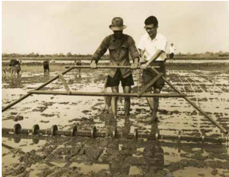
Figure 2. A Taiwanese technician teaching a Vietnamese farmer how to use an implement to mark rice spacing in order to maintain ideal distance while transplanting rice seedlings. 20

Rationalization also extended to cultural practices, such as maintaining precise and consistent distance between rice seedlings to ensure enough room for growth without underutilizing much needed land. Taiwanese farmers introduced new agricultural implements that could aid Vietnamese farmers in easily marking distances through imprinting grids in the soil (figure 2).