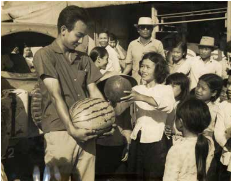
Figure 3. Photograph comparing the American variety “Dixie Queen” watermelon ( left ) at 14 kilograms (more than 30 pounds) introduced by the Taiwanese agricultural team compared to a native variety ( right ) in Định Tường. 26

Taiwanese teams expanded beyond rice to include other food crops, including onions, carrots, garlic, sweet potatoes, watermelon, soybean, cabbage, lettuce, peanuts, sorghum, corn, and mung beans (figure 3). Varieties were sourced from countries throughout the Global North and South, such as the United States, Australia, and Korea. Experiment stations run by Taiwanese compared varieties, which could include up to twenty-eight varieties, as in the case of onions ranging from Texas Early Grano 502 to Early Lockyer Brown. 25