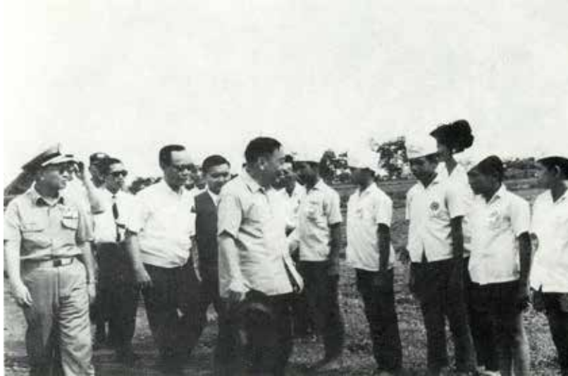
Figure 4. Chiang Ching-kuo (蔣經國, Jiang Jingguo), Premier of the ROC and son of Chiang Kai-shek, visits a 4-T (4-H) chapter in Biên Hòa province, Vietnam. 31

suggested that Vietnamese officials establish contests for the highest per-unit area of rice production, in which the “winning farmer will receive [an] award and will be asked to tell other farmers the ways and means by which he achieve[d] [his] goal.” 30 By incentivizing demonstration through informal competition, Taiwanese experts were hoping to create new information venues for rural Vietnamese farmers to learn from their own.