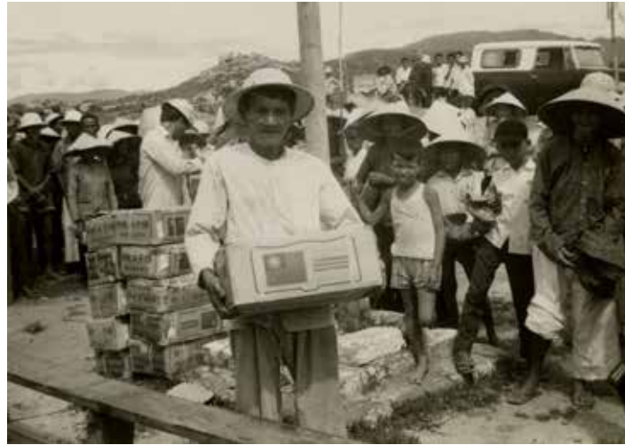
Figure 9. A Vietnamese recipient of Taiwanese aid. The box is adorned with the two flags of the Republic of China and Republic of Vietnam. 48

chemical composition, but was also a means to showcase the humanitarian actions and goodwill of Taiwanese assistance. Boxes containing vegetable seeds were adorned with flags of the ROC and RVN side by side, showing the origins of the gift along with partnership for the RVN peoples (figure 9).