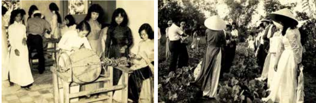
Figure 7 (left). "Home improvement agents" shown here are using a straw-rope making machine at a Taiwanese demonstration center in Biên Hòa. 45

Taiwanese government promotion of married-women's labor to fuel rural home-based production that formed the "satellite factories" of Taiwan's later industrialized economic growth (Hsiung 1996). In Vietnam, women played a prominent role in rural areas. Zhang Jiming indicated that by the time of his arrival in Vietnam, most men were involved in the ongoing war, and thus women often participated in extension and demonstration activities (figure 8). 44