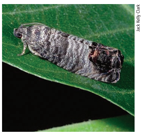
Codling moth (adult, shown) is a major pest of walnuts and other orchard crops.

Our analysis of PUR-reported pesticide use showed that many growers have not adopted alternative pestmanagement strategies despite their willingness to incur slightly higher costs when surveyed in 2002. Over the 3 years of our study, for example, only 13% to 17% of growers used at least one application of an alternative product during the growing season. Of these growers, 58% to 63% used more than one application of broad-spectrum insecticide in addi-