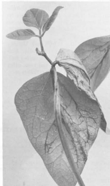
Fig. 4. Necrosis on cowpea inoculated with Okitsu-Wase isolate.

Dip preparations were obtained from infected cowpea leaves and stems, and from infected citrus leaves (table 5). Flex-