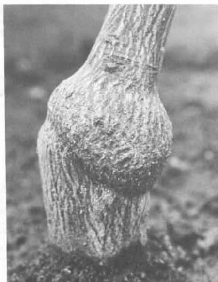
Fig. 2. Scion swelling of Satsuma on P. trifoliata root, six years after inoculation.

Young leaves collected from bud-union-creased Satsuma budlings were used for mechanical inoculations to cow-