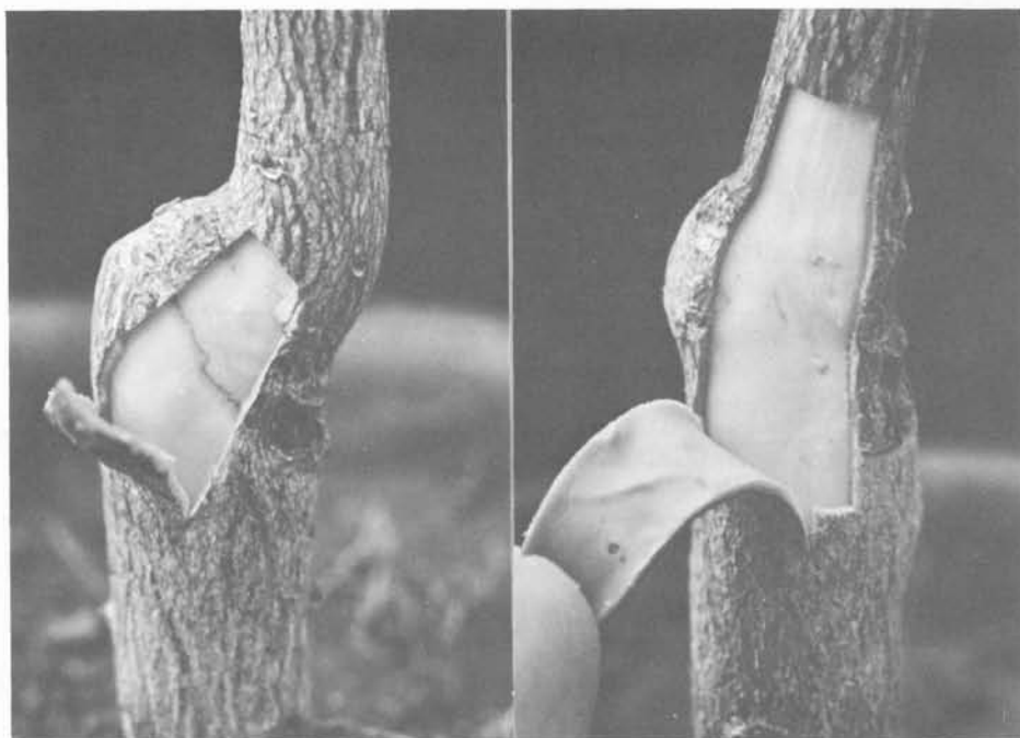
Fig. 1. Bud-union crease of Satsuma on P. trifoliata one year after inoculation (left); normal union (right).