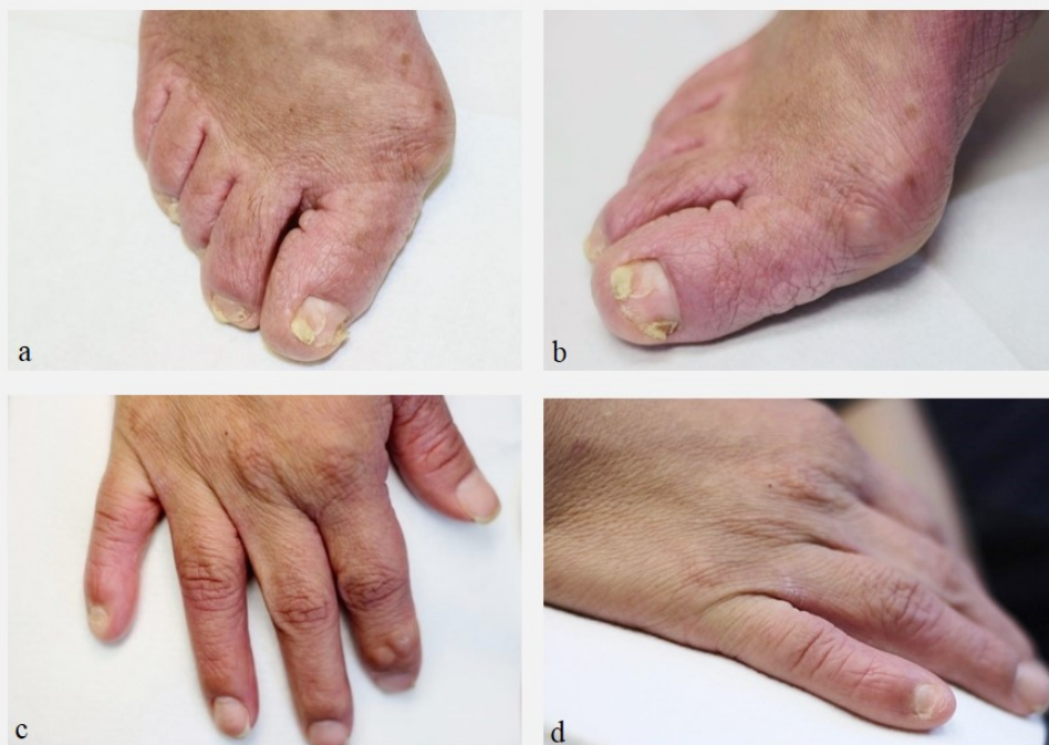
Figure 3: Two month follow-up after completion of treatment. a) right dorsal foot. b) right medial foot. c) right dorsal hand. d) right medial hand.

Histological analysis of the tissue biopsy revealed marked psoriasiform hyperplasia with mild spongiosis, prominent parakeratosis, mild dermal fibrosis, and mixed inflammation with scattered eosinophils and extravasated red blood cells. Numerous mites were present both within the keratin and within furrows in the upper epidermis. Cultures of the fissures of bilateral hands and feet revealed bacterial superinfection with Escherichia coli , Staphylococcus aureus , and Streptococcus agalactiae . Labs revealed no marked abnormalities.