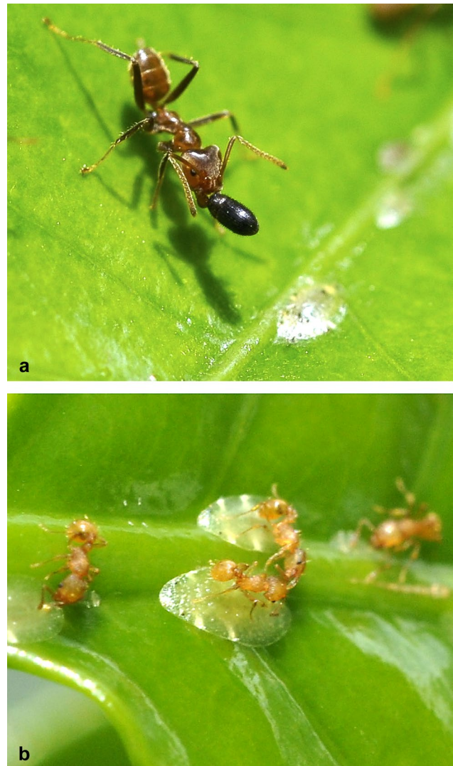
Fig. 2: Ant-hemipteran interactions on coffee. Many species of arboreal ants forage on coffee and tend hemipteran insects in exchange for honeydew. Ants that tend hemipterans often aggressively defend them and indirectly protect their host plant from other herbivores, such as the coffee berry borer (CBB). (a) Here, Azteca sericeasur workers tend the green coffee scale insect, Coccus viridis, while one ant attacks a CBB adult on a coffee leaf. (b) Wasmannia auropunctata workers, known predators of CBB, tend C. viridis on a coffee leaf.