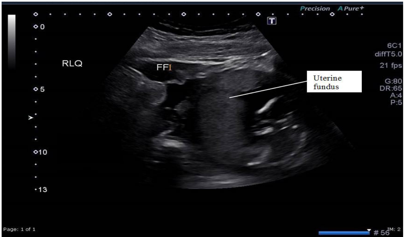
Image 1. Sagittal view of the uterus showing viable intrauterine pregnancy at 16 weeks and a large amount of free fluid (FF).