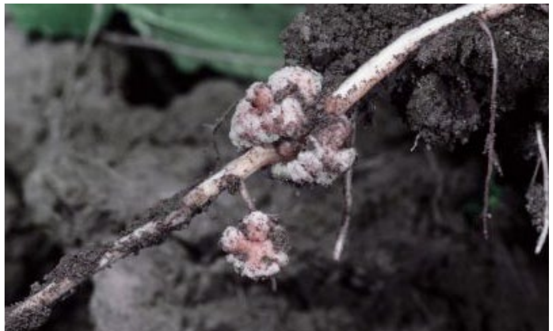
Figure 2. Nitrogen-fixing nodules on roots of berseem clover ( Trifolium alexandrinum ), an annual legume. These nodules are formed by beneficial bacteria that enter the root hairs and cause rapid division of root cells.

Pastures with a high clover content will often exceed the nutritional requirements for most classes of horses and can quickly cause a variety