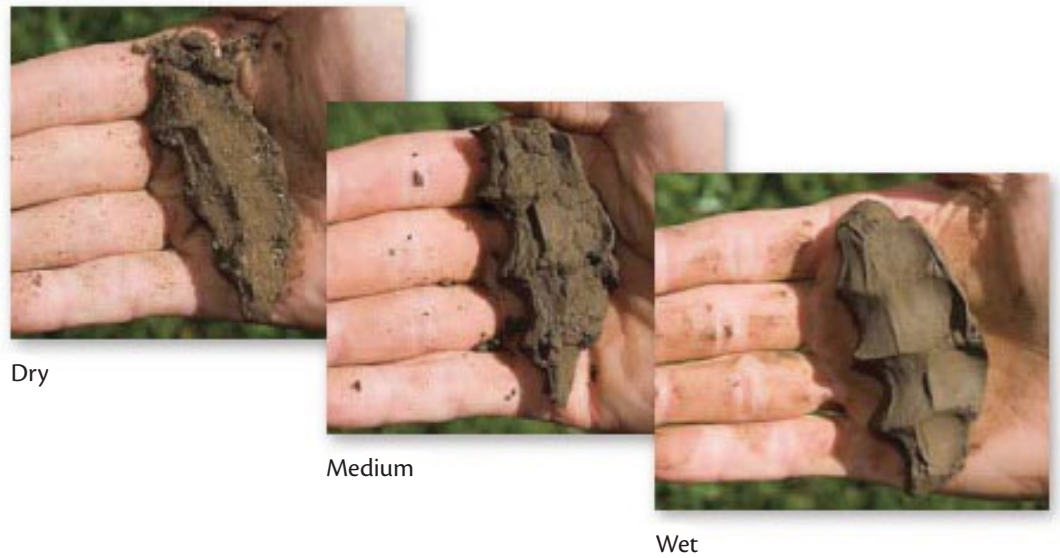
Figure 3. Determining soil texture and moisture by the feel method.