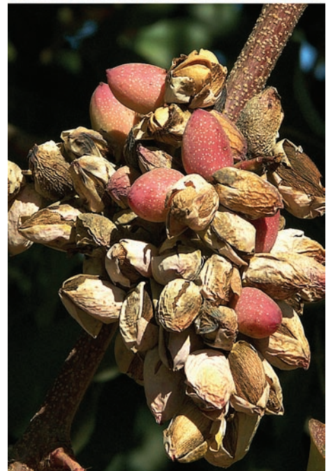
Top, navel orangeworm larvae feed on the kernels and increase aflatoxin contamination. Above, mummy nuts on the tree.

and February 2005, while there was no decline in navel orangeworm infestation of tree mummies during this same period (table 2). Because adult emergence is minimal during this period, we attribute the decline in navel orangeworm density on the ground to mortality. After February, however, adult emergence is a factor. Distinguishing between mortality and emigration in the field is a common problem in all insect mortality studies because the cause of the disappearance in the population is unknown, except for instances when adult emergence is minimal or cadavers are recovered (Siegel et al. 1987).