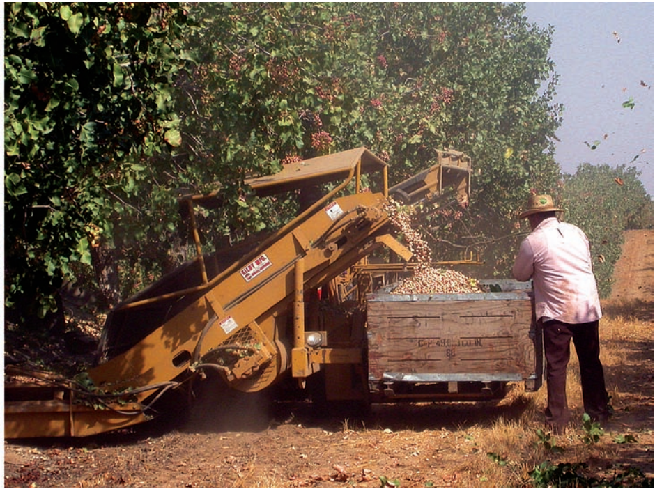
During the pistachio harvest, nuts that are not collected either fall on the ground or are left in the trees. These leftover "mummy" nuts can harbor navel orangeworm over the winter.

infested after the hull breaks down, exposing the shell and/or kernel (Beede et al. 1984; Bentley et al. 2005).