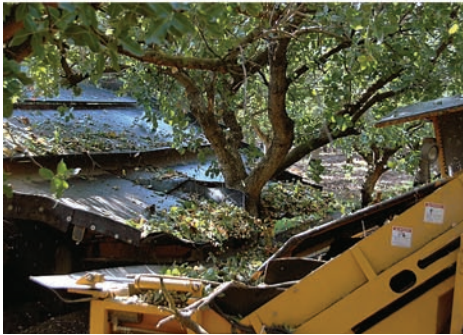
At harvest time, top , pistachios are removed from the tree by mechanical shakers. Bottom , a tree collar captures the nuts.