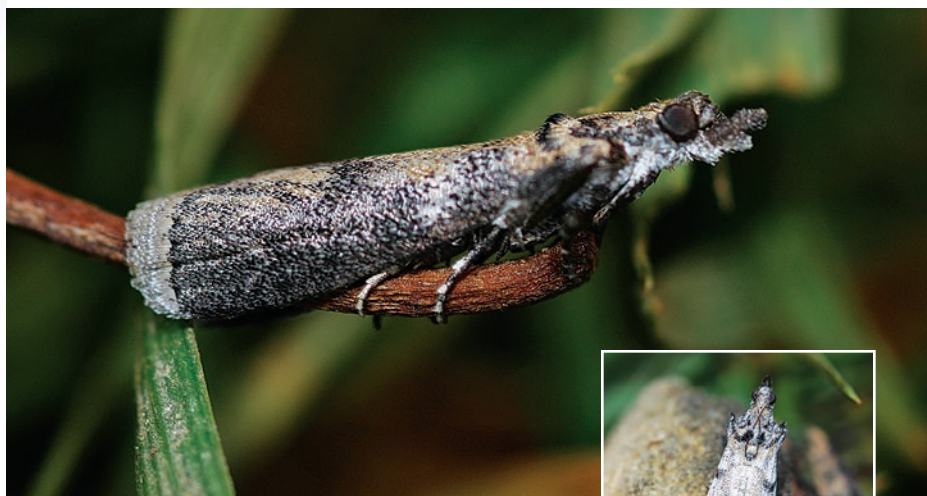
Navel orangeworm is a primary pest of pistachios and almonds in California. Eggs are laid on the exterior. When they hatch the larvae find cracks in the hull and burrow into the kernel.

Pistachios are harvested mechanically, first by shaking nuts from the