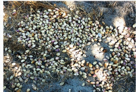
Tens of thousands of pistachios are spilled per acre after a typical September harvest.