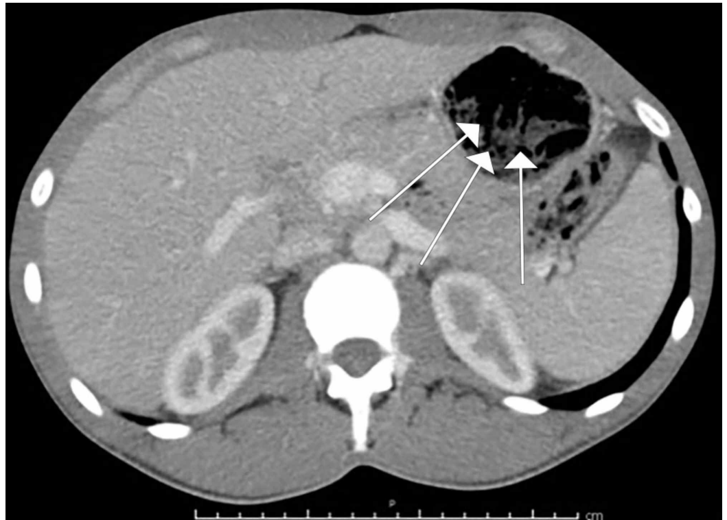
FIGURE 2: Computed tomography (CT) axial tomogram demonstrating amorphous material in the stomach compatible with ingested plastic bags (marked with white arrows).