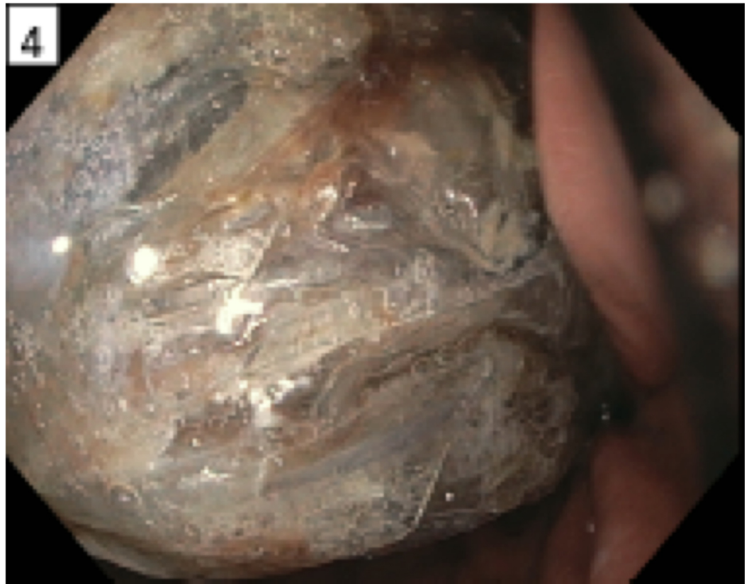
FIGURE 4: Plastic bags contained in the gastric lumen as visualized upon esophagogastroduodenoscopy.