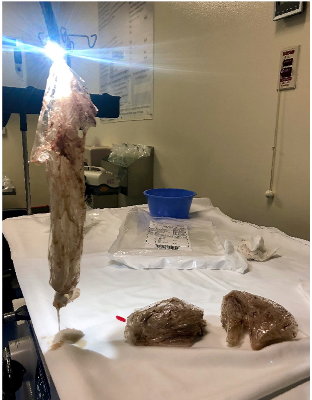
FIGURE 6: Three large, empty plastic bags sequentially retrieved from the stomach via esophagogastroduodenoscopy.