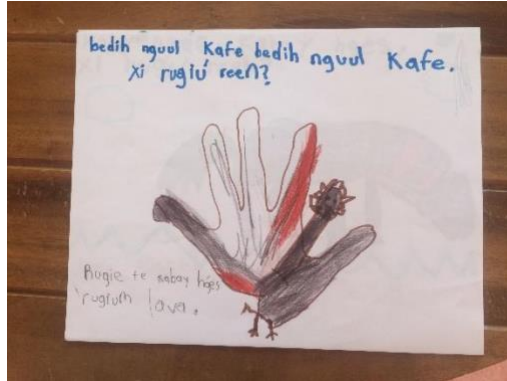
Figure 3: Image of a brown turkey from a student-created book (Images, 2018), with the text “Brown turkey, brown turkey, what do you see? I see a black horse looking at me.”

product. Furthermore, students were proud of the work they had done; they asked to read the book on subsequent days of class and quoted lines from the book when asked in the interviews what they enjoyed about the course. The text was also linked to a task-based activity completed later in the course when students took a hike with friends and family while collecting information about local flora and fauna by asking each other, “What do you see?”