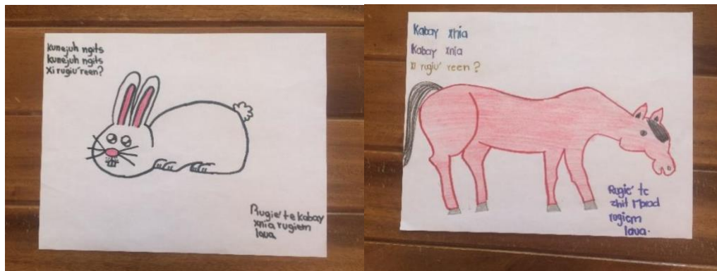
Figure 2: Two sequential pages from the student-created book (Images, 2018), with the text “White rabbit, white rabbit, what do you see? I see a red horse looking at me” (left) and “Red horse, red horse, what do you see? I see a purple cat looking at me.” (right).

The final method that we piloted is student-generated books in Zapotec. In this case, I read the book Oso pardo, oso pardo, ¿qué ves ahí? ('Brown bear, brown bear, what do you see?' by Martin & Carl, 2002) in Spanish. The book is repetitive, going through a number of animals of different colors and asking what those animals see. After reading the book, we worked together to translate the book to Zapotec. Each child was invited to choose their own animal and color and to illustrate it and add the relevant text in Zapotec. To link the pages together, the students chose the order that the pages would be presented in (Figure 2). The orthographies that students used were a combination of the community language committee orthography (which I used when presenting written materials in the class) and the students' individual choices in writing the language. I did not 'correct' any writing choices, as the presence of more than one proposed orthography in the community makes it difficult to say what the 'standard' spelling of any word should be. Furthermore, I did not want to discourage students' enthusiasm and independence by correcting their work; I instead encouraged students to read to me what they had written to make sure that they could read their own writing. However, I used the community language committee orthography when students asked me for assistance with spelling.