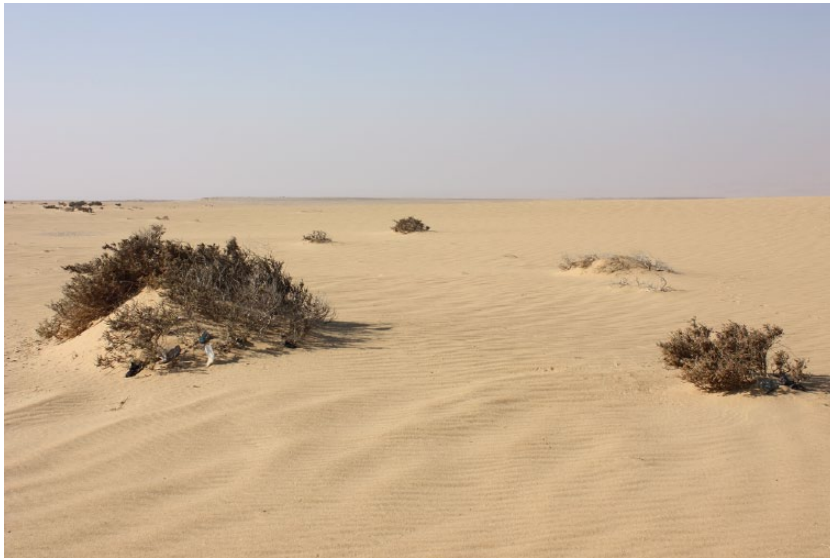
Figure 3. Haloxylon salicornicum in hyperarid desert near E29H1.