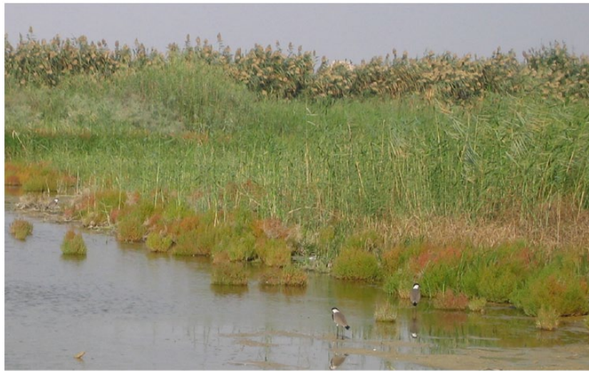
Figure 2. Present vegetation community on south lakeshore of Lake Qarun, with Sarcocornia spp. in foreground, Phragmites australis and Tamarix nilotica in midground, and Phragmites australis in background.

timing of the AHP in the Fayum remain the subject of debate (Shanahan et al., 2015), but one of the few robust paleoclimatic records in the eastern Sahara indicates an abrupt termination of the AHP by 5500 BP (Liu et al., 2007: 1833; Ritchie, 1994; Ritchie et al., 1985).