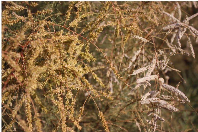
Figure 4. Tamarix nilotica in flower.

cattail (Typhaceae), and grass (Poaceae) pollen in the Tersa core suggests that marshlands were considerable in size (Hamdan et al., 2016). Given the strong likelihood of higher rainfall in the early Holocene, an increased density and diversity of woody taxa in the Fayum is likely. Acacia is especially likely to have been more common, as it is in wood charcoal assemblages in areas of northwestern Egypt that are today hyperarid and devoid of woody plants (Cottini and Castelletti, 2014; Neumann, 1989a: 103; Zahrán and Willis, 2009).