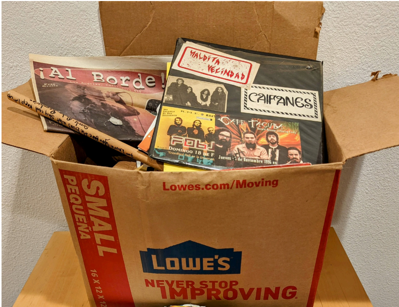
Figure 1. Recently shared materials for the Rock Archivo de LÁ by a collector. This box includes: 1990s event flyers, photographs, and numerous issues of magazines and fanzines, among them Al Borde , La Banda Elástica , and Frontera .

that some of the materials were more than thirty years old. These flyers, photos, posters, tickets, magazines, and zines held significant sentimental and testimonial value, but they were unsure about what to do with their collections, aside from keeping them inside shoeboxes and storing them in closets or garages. Together we pondered ways to share these materials. Most important to me was finding a way to share the histories that the collections contain.