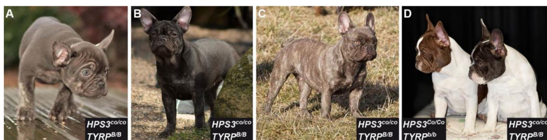
Figure 1. Coat color phenotype of cocoa and chocolate French Bulldogs. Genotypes at the underlying loci are indicated (see Section 3.2) (A) Cocoa puppy with brown coat and blue eyes. (B) Same dog as shown in (A) as an adult. Note that the coat and eye color has markedly darkened over time. (C) Cocoa brindled dog. (D) TYRP b/b (chocolate) and HPS3 co/co (cocoa) mutant dogs in comparison. In adult dogs, cocoa is slightly darker than TYRP1 -related brown.

Several brown French Bulldogs were genotyped as homozygous for the wild type allele at all three common TYRP1 variants ( b^c , b^s , b^d ). We therefore hypothesized that their coat color was due to a new allele that has not yet been reported in the literature. This new coat color appeared to be slightly darker than the TYRP1 -related chocolate coat color in adult dogs. From now on, we will refer to this dark brown phenotype as cocoa (Figure 1).