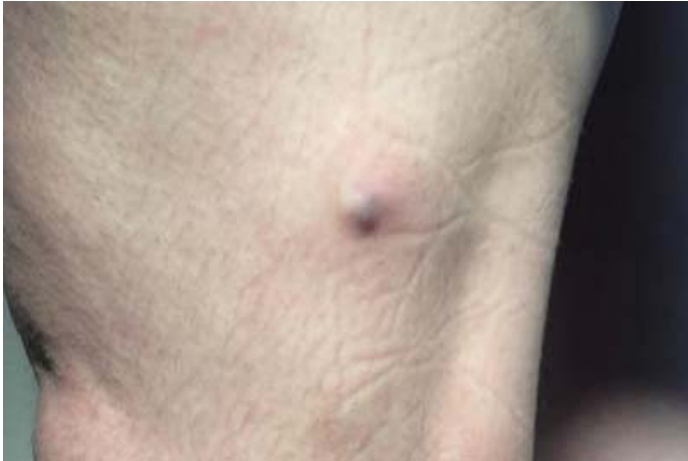
Figure 1. Firm nodule with a bluish hue located on the left lateral thigh.

As our clinic had previously diagnosed the patient's last two pilomatrixomas via both shave and punch biopsies and also performed the respective excisions, another biopsy was deemed unnecessary at the time of the visit for pilomatrixoma diagnosis. Instead, an excision was recommended and was subsequently performed the following week. No recurrence was reported post-operation. Dermatopathology analysis revealed a dermal basaloid nodule with cystic architecture. Conspicuous matrical and shadow cells were noted, along with focal areas of calcification ( Figure 2 ). Findings from dermatopathology analysis were consistent with pilomatrixomas, as expected.