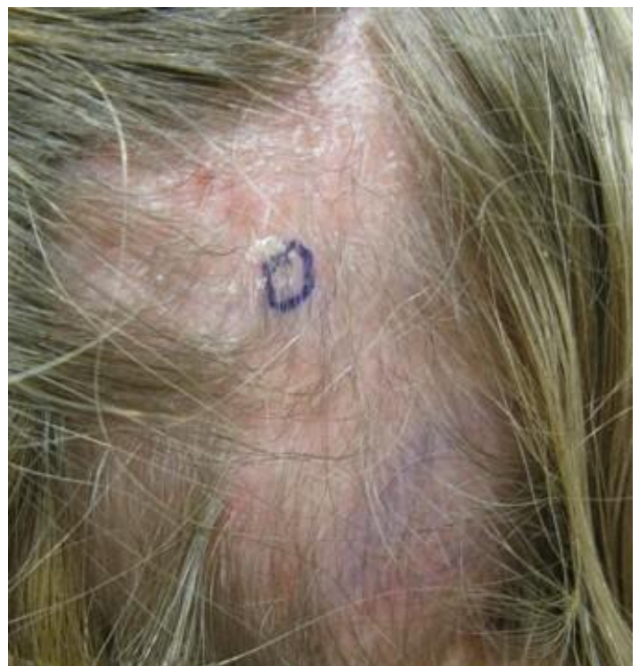
Figure 1. Clinical presentation. Original patch of alopecia on the right temporal scalp with biopsy site marked.

A 21-year-old female with Crohn's disease presented to Dermatology with subacute worsening of chronic, erythematous, scaly plaques on the scalp and ears, with new areas of hair loss developing over 2 months ( Figure 1 ). She denied any oral or genital lesions, pustules, vesicles, arthralgias, joint swelling, or worsening Crohn's symptoms. No changes in medications or personal care products had been made prior to onset of the eruption. She intermittently had been applying mupirocin to the lesions without effect.