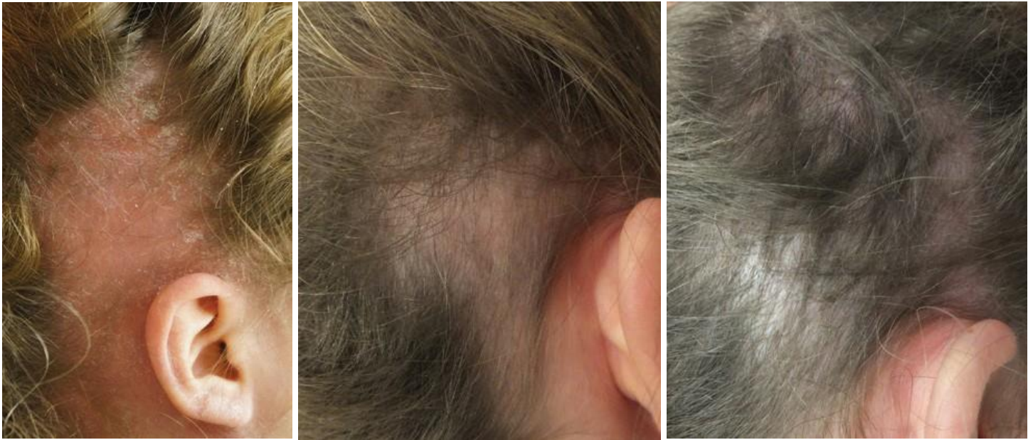
Figure 3. (Left to right). Progressive resolution of alopecia with photos taken at the time of monthly intralesional triamcinolone acetonide injections.

No infectious organisms were noted on periodic acid–Schiff–diastase (PASD) stain.