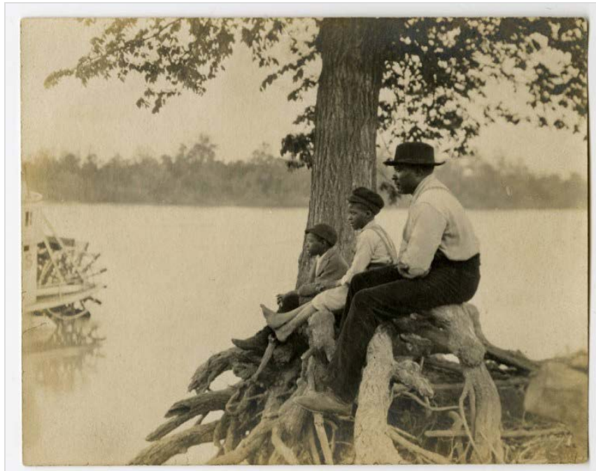
Watching the sternwheel steamboat pass, 1900.

The history of African American slavery is tied to the history of the entire Mississippi River and even includes accounts of slaves held in the upper Mississippi River Valley from the Revolutionary War to the end of the Civil War. There were also significant abolitionist efforts documented in the upper Mississippi River Valley.