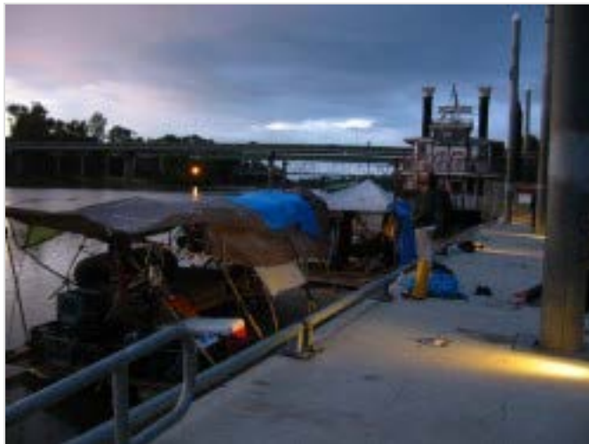
Raft flotilla on Willamette R., 2007

For those cities facing ecological and economic crisis and attempting to reestablish a connection to their rivers, the impulse is to create a shiny, clean and sanitized parkland – a kind of mall with a river running through it – rather than a wild and natural waterway. Cities create concrete abutments, river walks, riverside parks, aggressive policing, and regularly remove shrubs and foliage from the floodplain to discourage unauthorized use, such as squatting.