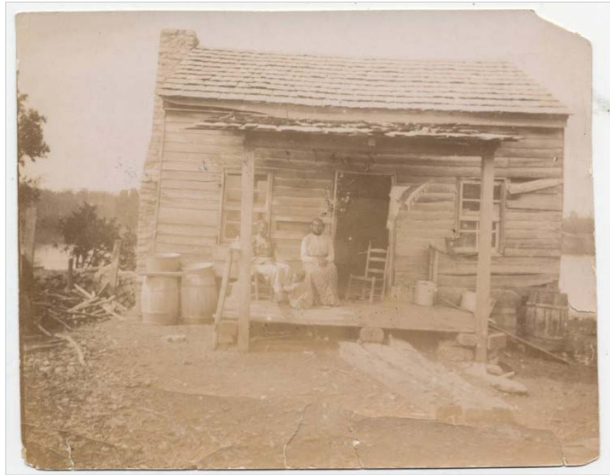
Two African-American women and baby on porch of river dwelling, 1900.

slave market” (Buchanan, 2004). And black steamboat workers held an important source of income to both slave and free African American communities.