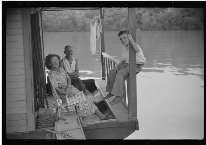
Family on front porch of houseboat on river in Charleston, West Virginia, 1938

During the 1960s and 70s, a water-based analogue of the Back To The Land movement blossomed in leftover houseboat communities. People looked to the relative freedom of rivers, lakes, and seas, especially in floating communities in Sausalito, California, Seattle, Washington, and Portland, Oregon. Largely class-based conflicts between these houseboat communities and land-based home owners decimated these communities, and still flare up occasionally in the remnants of these communities today.