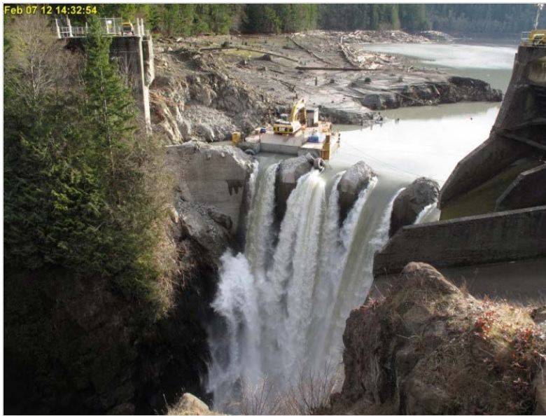
Glines Canyon Dam, Elhwa River in Olympic National Park

The engineering of river beds has changed the character of most major rivers. Since the early to mid 20th Century, the Army Corps of Engineers in order to maintain navigable channels and help with flood control has maintained a program of river engineering . This includes channelization, that is dumping rock and concrete along the banks of rivers to prevent it from eroding its banks and changing course, constructing levees and wing dams to direct the river's flow into a straight, narrow channel and prevent sedimentation.