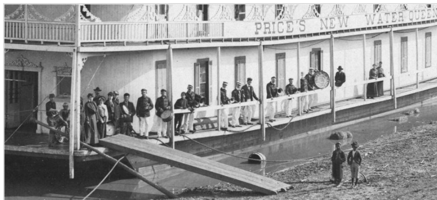
Water Queen Showboat with Actors and Musicians, 1901

African slaves played an early part in the formation of the modern Mississippi River. In the early 19th century African slaves built the first levies on the lower Mississippi. A 100 years later, a half century after slavery was abolished, African American plantation workers were forced to work in hazardous conditions to shore up levies in the Great Flood of 1927, but at the waters rose, were left stranded for days without provisions while white women and children were hauled to safety.