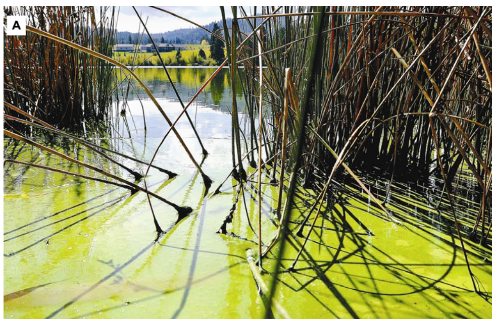
Figure 1. Algal bloom caused by the cyanobacterium Microcystis aeruginosa in Middle Foy Lake near Kalispell, Montana in September, 2010. Photograph courtesy of Nate Chute, Daily Inter Lake [16] (A); Confirmation of this bloom as M. aeruginosa microscopically (cell size 2–3 \mu\text{m} ) and detection of high concentrations of the cyanobacterial hepatotoxin microcystin-LA in surface scum was performed by scientists at the University of California, Santa Cruz (B).

Death from microcystin intoxication has been reported in fish [1,2], birds [2,3], companion animals [4–6], livestock [7,8], wildlife [9,10] and humans [11,12], and significant blooms can cause widespread morbidity and mortality [13]. Microcystins are structurally diverse cyclic heptapeptides that are primarily considered as hepatotoxins [14], although the gastrointestinal tract, kidney and other organs are also susceptible to toxin-mediated damage [15]. Human and animal exposure to microcystin typically occurs through ingestion of contaminated water or food, or by licking contaminated fur.