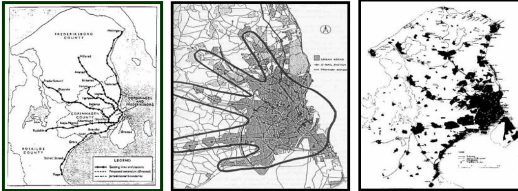
Figure 1. Copenhagen’s “Transit First” Spatial Evolution: From Finger Plan, to Five-Axis Radial Investment, to Corridors of Satellite, Rail-Served New Towns

The ability of inter-mixing land uses along linear corridors to produce an inter-mixing of bi-directional flows is an under-appreciated benefit of sub-regional land-use balancing. There is no better example of the efficiency and sustainability gains that come from balanced growth than Stockholm, Sweden. The last half-century of strategic regional planning has given rise to a regional settlement and commutation pattern that has substantially lowered car-dependency in middle-income suburbs. Stockholm planners have created jobs-housing balance along rail-served axial corridors. This in turn has produced directional-flow balances. During peak hours, 55 percent of commuters are typically traveling in one direction on trains and 45 percent are heading in the other direction. Stockholm's transit modal share is nearly twice that found in bigger rail-served European cities like Berlin and even higher than inner London's market share. Perhaps most impressive, Stockholm is one of the few places where automobility appears to be receding. Between 1980 and 1990, it was the only city in a sample of 37 global cities that registered a per capita decline in car use -- a drop off of 229 annual kilometers of travel per person. 1