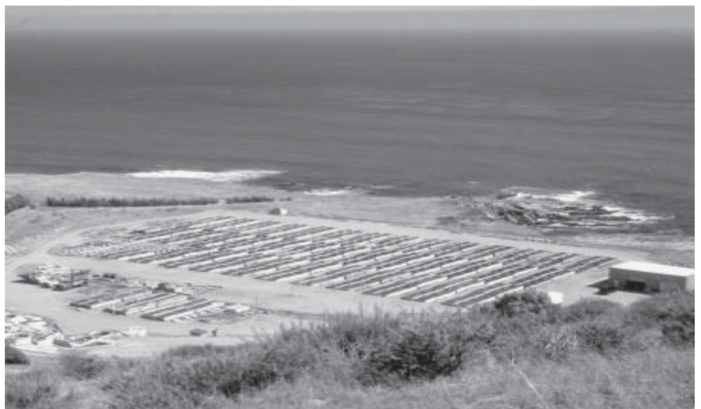
At any given time, The Abalone Farm, Inc. in Cayucos, California, may have about 2 million abalone growing in concrete tanks along the coast. The company is working with scientists to develop oral antibiotic therapies for treating withering syndrome.