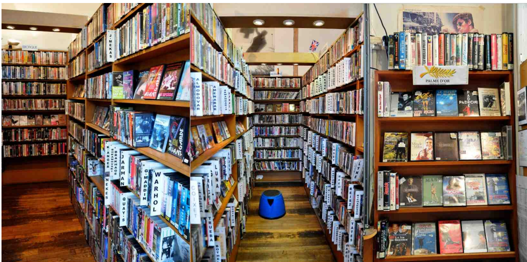
Figure 14. Vidéosphère, organization by nation, genre, and prize winners