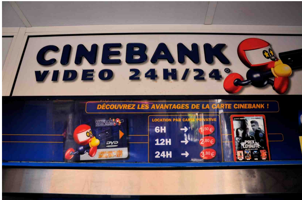
Figure 9. Cinebank Rate Chart at the rue Oberkampf location