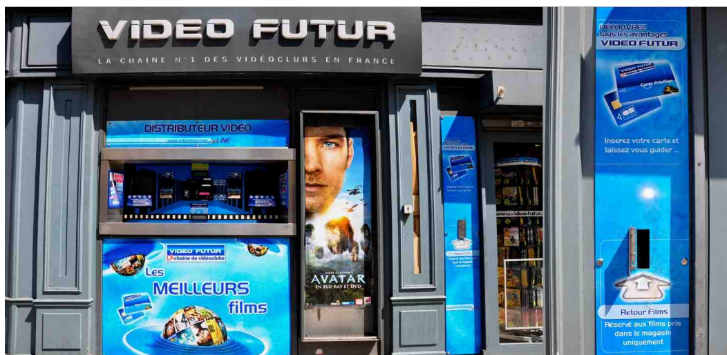
Figure 7. Automated machine at the 85, rue Monge Video Futur location