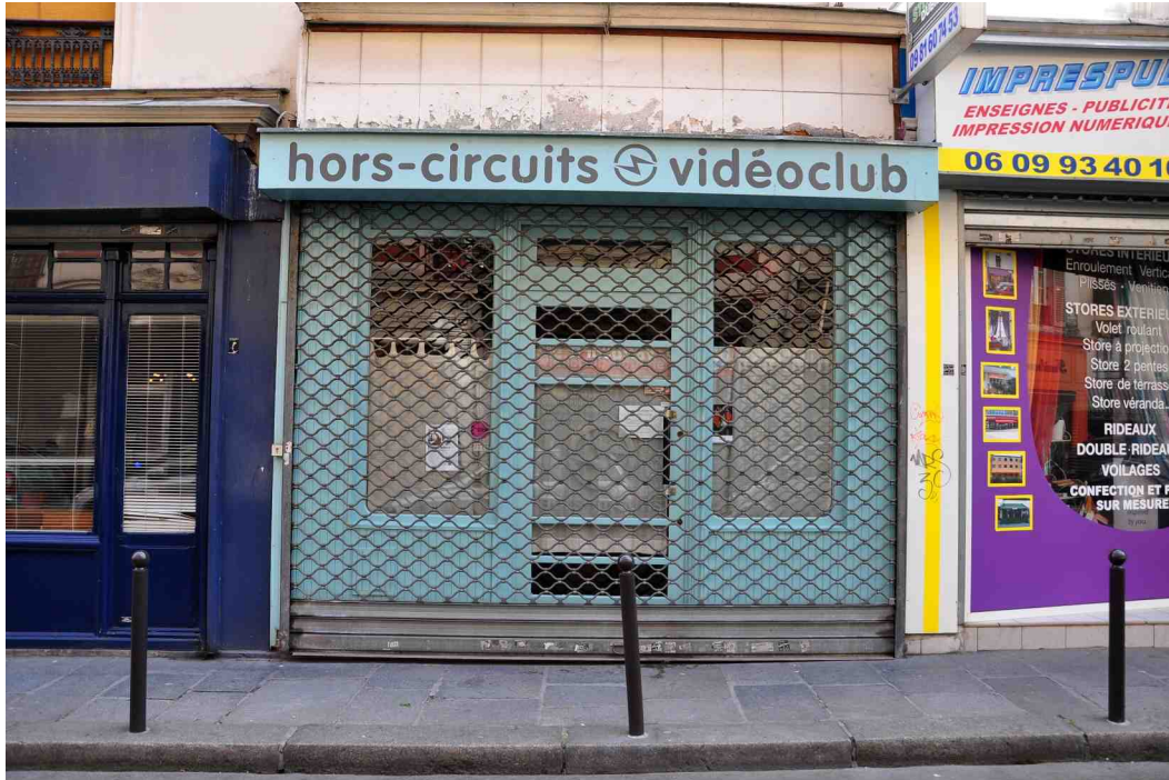
Figure 17. hors-circuits vidéoclub, 4, rue de Nemours, 75011 Paris. Closed, but only for summer vacation