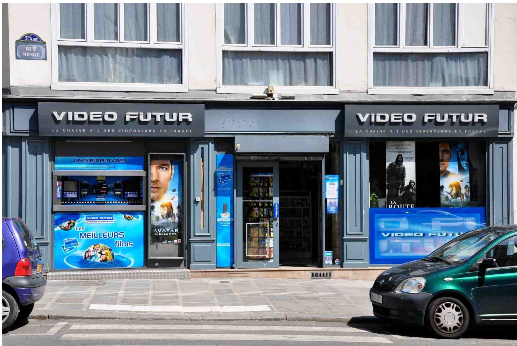
Figure 5. Video Futur, 85, rue Monge, 75005 Paris

service ( à domicile ), store locations ( nos magasins ), and cinebank machines ( distributeurs cinebank ). This agglomeration, however, is very much in process, as indicated by the continued use of the Glowria name brand, the uneven integration of rental kiosks within stores (e.g., they tend to be operated by subcontractors), and inconsistent networking of franchise locations (e.g., in many cases customers can only return discs to the stores and kiosks where they originally rented them).