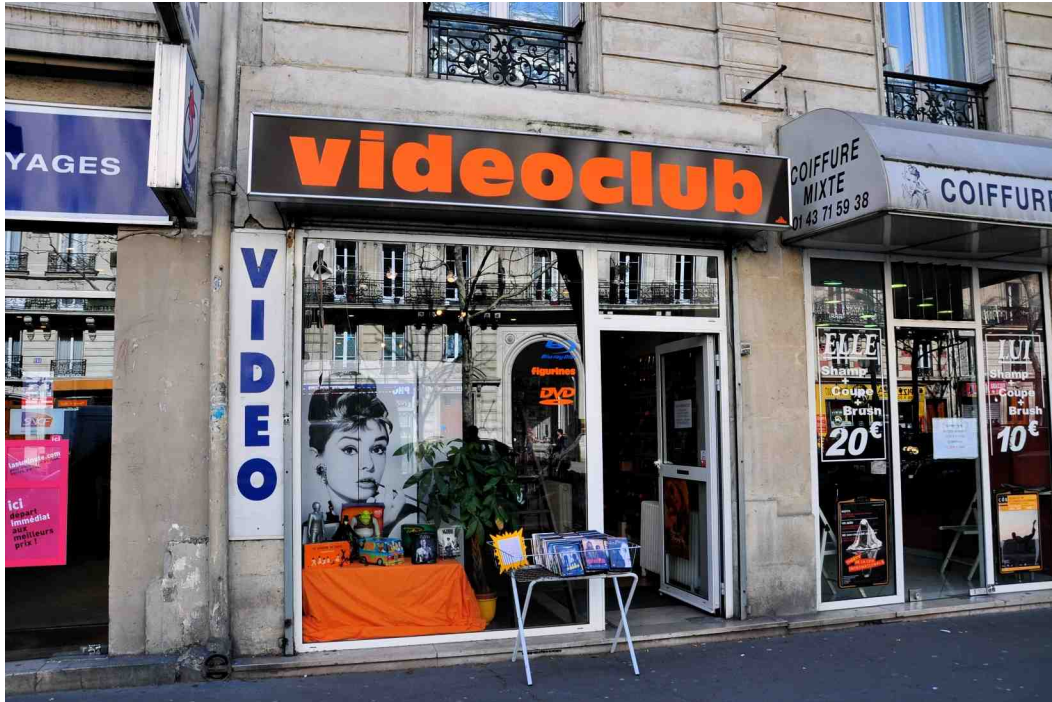
Figure 2. La Onzième Heure, 168, boulevard Voltaire, 75011 Paris