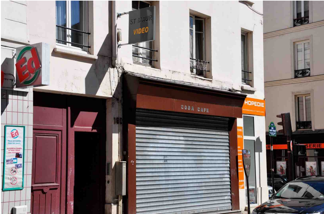
Figure 3. Former Site of St. Maur Video, 160, rue Saint-Maur, 75011 Paris