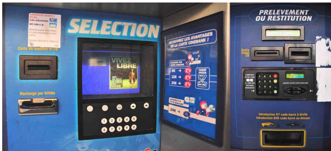
Figure 10. Cinebank machine details, rue Oberkampf location

The Cinebank brand operates 34 video stores and automated machines in Paris, including the location we visited at 115, rue Oberkampf. 34 The site