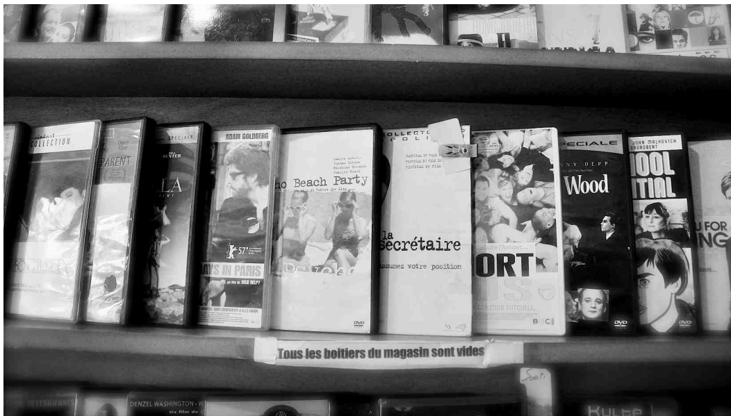
Figure 1. “Tous les boîtiers du magasin sont vides” [“All of the store cases are empty”]