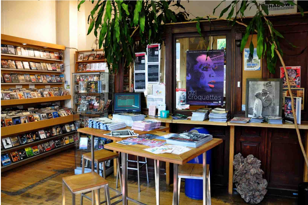
Figure 12. Vidéosphère, area displaying catalogues, flyers, brochures, and searchable computer database of the store's holdings

Sorted by national and regional cinemas, award winners, new releases, film movements, directors and genre, Vidéosphère's layout curates a particular experience of film history and its materiality. The thousands of VHS and DVD boxes on the store's shelves, for instance, are only for show, as renters use reference numbers to rent titles at the counter, and leave the store with slender sleeves. The store's numerous membership options also attest to the diversity of renters and habits. Starting at 4.5€ per film with yearly subscription (60€), and 6€ without, plans range from individual to cinephile and professional, including deals for weekends and, for the cinephile, five movies for five days for 22€, with subscription.