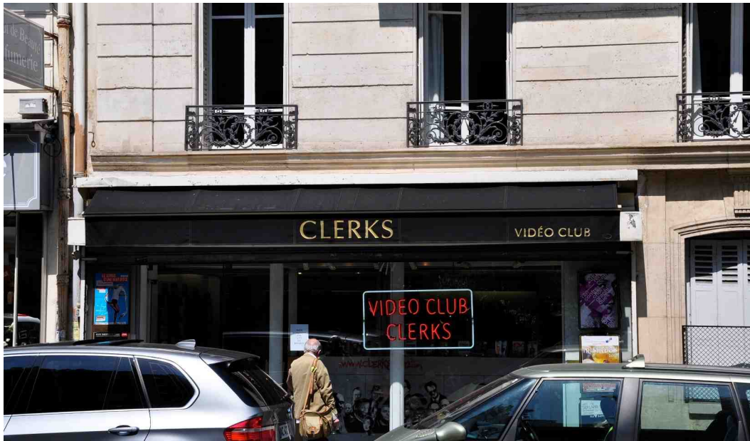
Figure 15. Clerks, 8, rue des Ecoles, 75005 Paris

Smaller stores, such as Clerks in the fifth arrondissement and JM Vidéo and Vidéo Club, both in the eleventh, also continue to eke out a living by combining new releases with large collections of French cinema, international art films, classical Hollywood, and other cinephillic fare. In each of these stores, owners explained that a large selection of classics, cult films, and documentaries, combined with popular new releases, remains one of their few remaining tools for competing with VOD and digital downloading. Several also referenced the continued importance of the store as a social space, where relationships and tastes co-evolve. In-store displays attempt to capitalize on the stores' large and diverse stocks by recommending classics and art films rather than relying on new releases that are more easily accessible through other distribution sites. Stores such as JM Vidéo also attempt to bolster profits through additional services including DVD repair, as well as used discs for sale and a small back room with adult films.