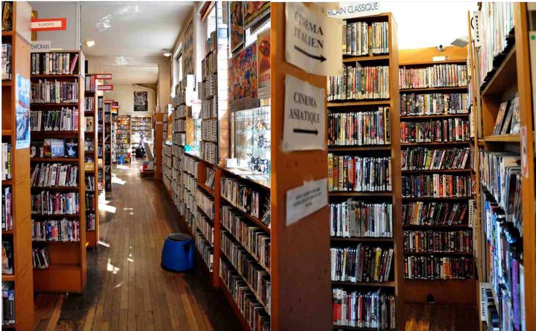
Figure 13. Vidéosphère's 35,000-title collection comprises a maze of aisles housing DVDs and VHS cassettes, as well as toys, games, and memorabilia