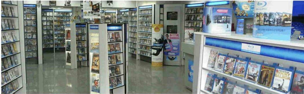
Figure 6. Interior of a typical Video Futur shop

controlled downloading and streaming of content onto household screens and mobile devices.