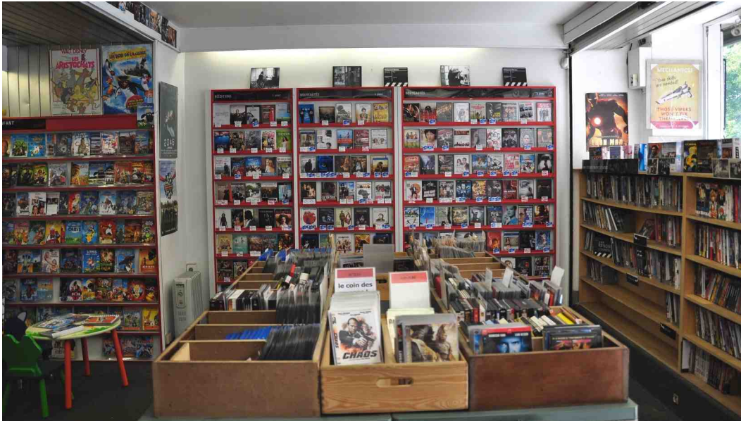
Figure 16. Clerks, interior view of display cases

Most independent owners we interviewed allowed that the prospects for survival in the current market remain bleak at best (several admitted that they only hope to stay open for as long as possible). At the same time, the success of stores such as JM Vidéo (open since 1982) and more recently opened shops such as hors-circuits vidéoclub (opened in 2003), suggest that the independent model remains viable, at least in the short term. Clerks, for instance, benefits from its proximity to a large university population, including many foreign students. The shop even offers an English language website. 35