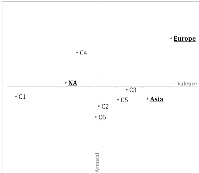
Figure 2: Aggregate theoretical positivity and engagement for each subcorpus.