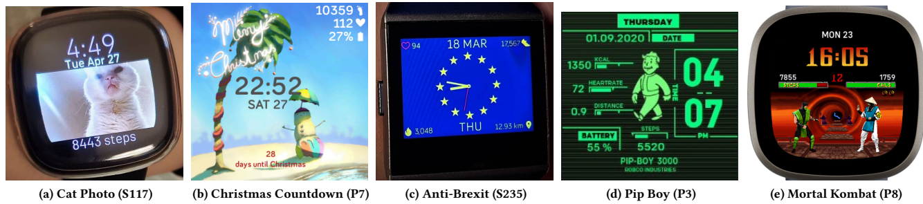
Figure 3: Example personal meaning customisations participants selected for their watchfaces. Participants selected and created watchfaces which matched their personal interests, conveyed opinions, or highlighted aspects of their identity. Some participants who created their own watchfaces aimed to integrate their tracked data into the design.

S176 described that “seeing my grandchildren [on my watchface] helps me get up and move. I’m struggling with my knee so bad :( seeing them makes me try to move a bit and make myself stronger to spend more time with time. It’s like a persistent reminder to try and get up.” S83 similarly expressed that “my baby boy is there to help me create a hot mom bod 😂 I started a fitness journey to be in tip top shape to chase this baby around when he gets bigger and have the energy to play with her whenever she wants.” Participant further found watchfaces which matched with pop culture interests similarly motivating, such as S122 “it goes without saying that I am a huge Simpsons fan. Homer goes into ‘fun mode’ as I get to my step goal, which is funny to see. It’s like a little reward that I’m getting, seeing Homer at all of his splendor when I hit 100%” and S142 “big spiderman fan here. It helps me enjoy my fitbit a bit, sometimes even feel a bit heroic when I get really active.”