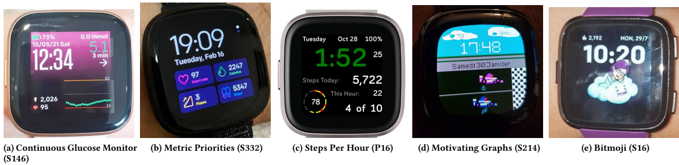
Figure 2: Example data and aesthetic customisations participants selected for their watchfaces. Participants frequently customised their watchfaces to show the metrics most important to monitoring their health and wellbeing, picking or altering watchfaces with colors and styles they found visually appealing.

more than worth it. I would think it's the most basic set of stats that most users want to look at. The Fitbit is both a watch and a tracker, so you expect to see all this information simultaneously." P18 described how she would judge whether a watchface was useful to her based on the metrics it provided, "the scientific part of my brain always kicks in and goes, 'Oh, it doesn't have this metric', or 'Oh, it doesn't have that metric'. So then I go back to looking at my watchfaces with metrics on them."