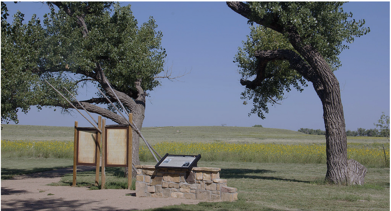
FIGURE 2. Signage at Sand Creek Massacre National Historic Site.

by United States soldiers at Sand Creek in the recent effort to locate and memorialize the land upon which their ancestors had been murdered. Other speakers demurred, insisting that process had not been so simple. Competing claims to authority over interpreting the past, struggles over incommensurable narratives, and disputes over disparate methodologies and epistemologies had divided the people engaged in the memorialization effort, they noted. But in the end, the Sand Creek descendants, as they typically called themselves, had worked with representatives of the Park Service to preserve the massacre site. 2