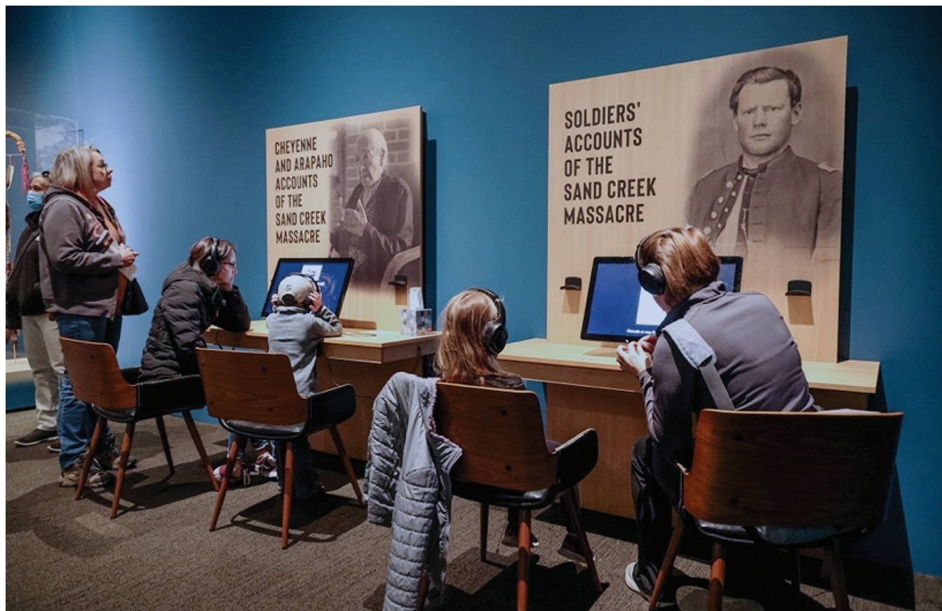
FIGURE 10. Listening stations at History Colorado’s Sand Creek exhibit.

A preliminary meeting, focused on planning, took place in January of 2020. The group intended to reconvene in March, but the COVID-19 pandemic threw their efforts—among other things—into chaos. After that, work on the