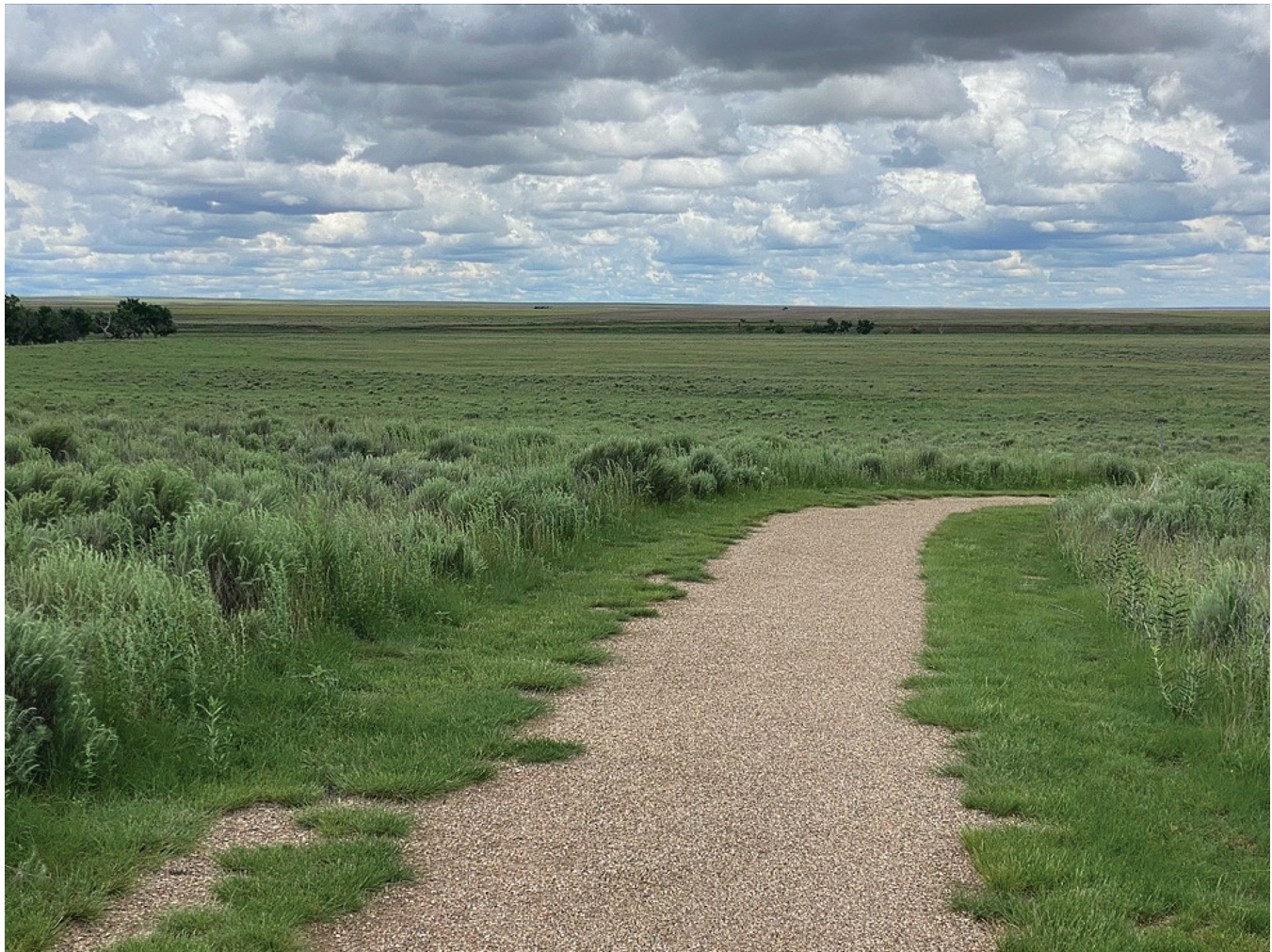
FIGURE 3. A pathway at Sand Creek Massacre National Historic Site. ELLENI SCLAVENTIS

One of the most heavily trafficked trails in the historic site leads to a rise known as the monument overlook. From atop that vantage point, rare high ground on the plains, onlookers can gaze down upon a large bend in the creek, the location where Black Kettle's village stood on November 29, 1864. Sand Creek's bottom, which is now filled with mature cottonwood trees, hosted some of the massacre's most brutal violence. The area is off limits to the public. As Steve Brady, a Northern Cheyenne headman who participated in the memorialization process noted, “Our ancestors