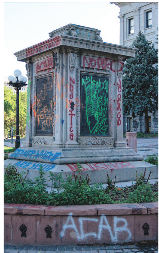
FIGURE 8. The spray-painted plinth after protestors removed the Colorado Civil War memorial in June 2020.

On June 25, 2020, exactly a month after police in Minneapolis lynched a Black man named George Floyd, protestors in Denver tore down the state’s Civil War memorial and spray-painted slogans, including “No Peace, No Justice,” on its empty plinth. A person who helped topple the statue, a local example of a nationwide movement to destroy edifices of White supremacy, explained: “We figured what better way to get rid of a statue that represents racism.” An eyewitness to the event noted, albeit with some confusion: “I know that [soldier] is one of many men who were part of the Sand Creek Massacre and many other genocidal acts that happened throughout Colorado’s early history.” Governor Jared Polis responded with “outrage at the damage to a statue that commemorates the Union heroes of the Civil War who fought and lost their lives to end slavery.” He suggested “those responsible” were “hooligans” or perhaps “white