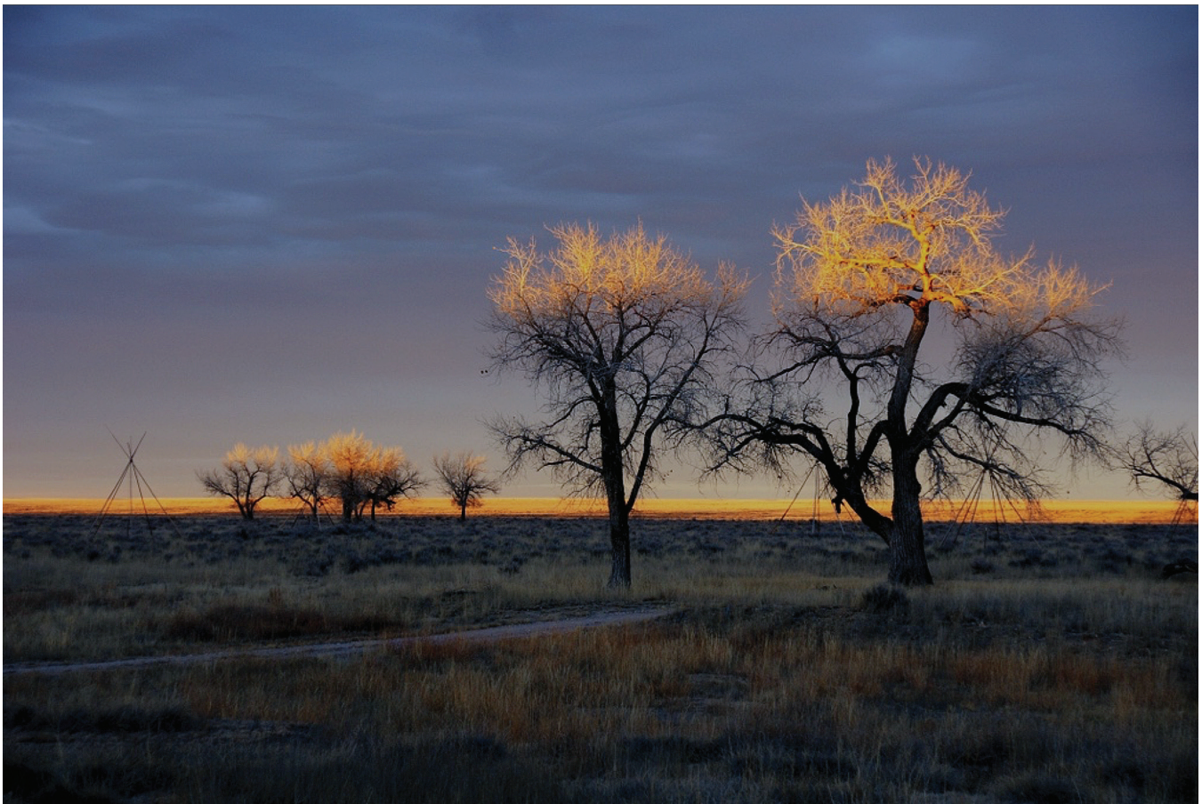
FIGURE 12. The Sand Creek site on the morning of the massacre's sesquicentennial.