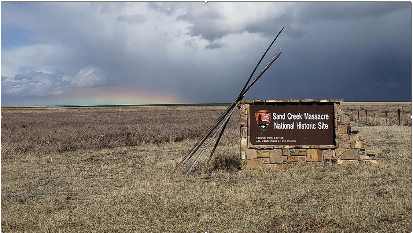
FIGURE 1. The entrance to Sand Creek Massacre National Historic Site. ELLENI SCLAVENITIS

by United States soldiers at Sand Creek in the recent effort to locate and memorialize the land upon which their ancestors had been murdered. Other speakers demurred, insisting that process had not been so simple. Competing claims to authority over interpreting the past, struggles over incommensurable narratives, and disputes over disparate methodologies and epistemologies had divided the people engaged in the memorialization effort, they noted. But in the end, the Sand Creek descendants, as they typically called themselves, had worked with representatives of the Park Service to preserve the massacre site. 2