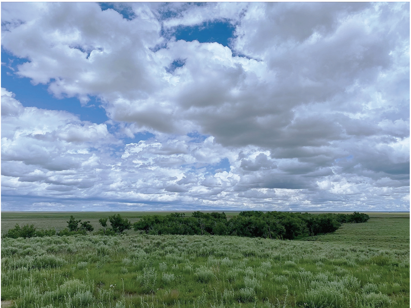
FIGURE 4. Cottonwood trees in the creek bottom at the historic site. ELLENI SCLAVENTIS

were killed there in cold blood. They still lie on that sacred ground. We cannot have them disturbed by thoughtless sightseers. And so we're insisting that the Park Service not open that area to outsiders of any kind." Once the backdrop to unspeakable acts of violence and brutality, the monument overlook now offers visitors a place for quiet contemplation. 4