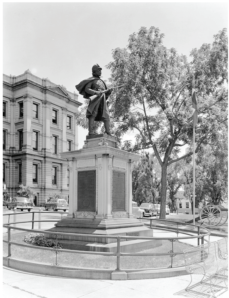
FIGURE 6. The Colorado Civil War memorial.