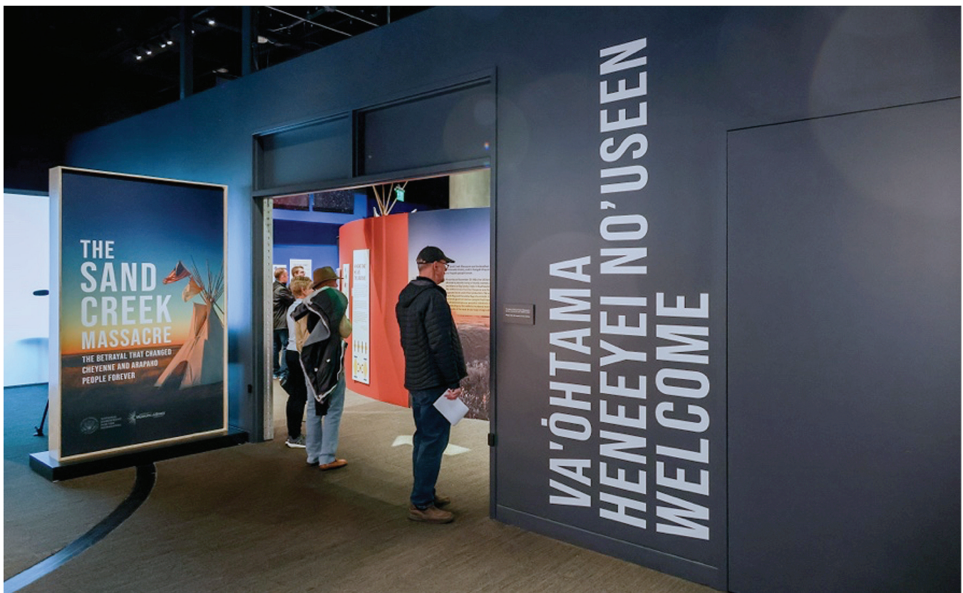
FIGURE 11. The entrance to History Colorado’s Sand Creek exhibit.