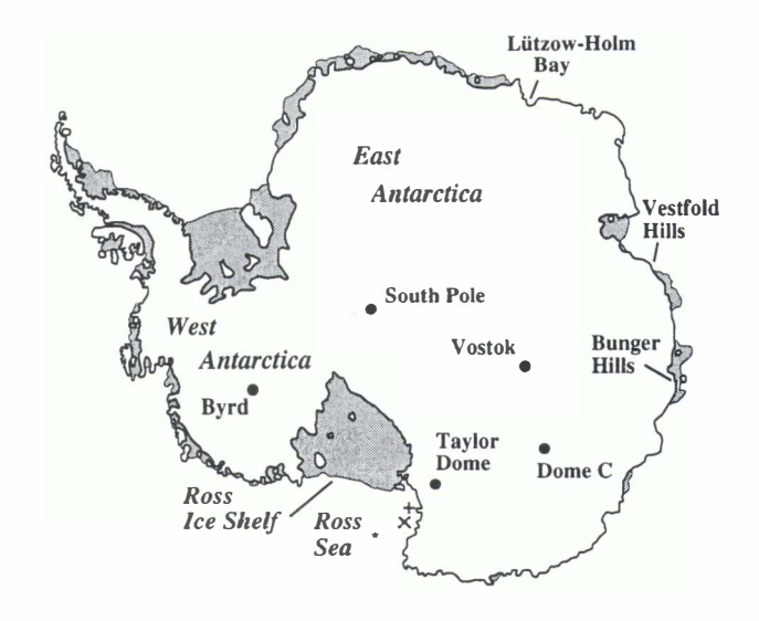
Fig. 1. Map of Antarctica, showing locations mentioned in the text. Shaded areas are ice shelves. Ross Sea sediment cores are shown by plus sign (core NBP9501-KC31), cross (NBP9501-KC37) and star (NBP9501-KC39). Terra Nova Bay is on the coast between cores 31 and 37. McMurdo Sound is the small embayment to the right (west) of the Ross Ice Shelf.

Taylor Dome is located just inland of the Transantarctic Mountains across McMurdo Sound from Ross Island, Antarctica. Taylor Dome is a local ice-accumulation area that