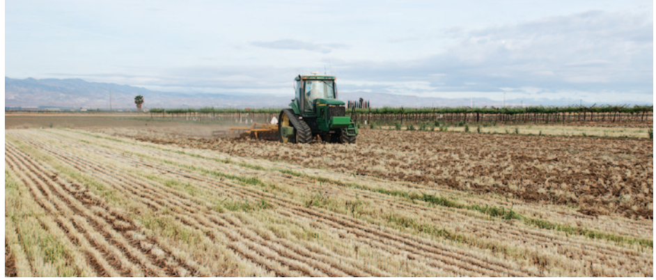
Jeffrey P. Mitchell

To account for possible changes in soil bulk density resulting from standard tillage, two 3-inch-diameter soil cores per plot were collected, dried and weighed following the disking operations. These density determinations were then used with the gravimetric water content measurements to calculate soil volumetric water content (SVWC). Percentages of