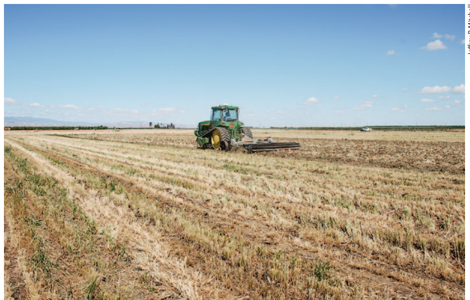
In Five Points, soil is disked to incorporate residues — the conventional practice. Transitioning to reduced-tillage practices could significantly improve water use efficiency in California agriculture.